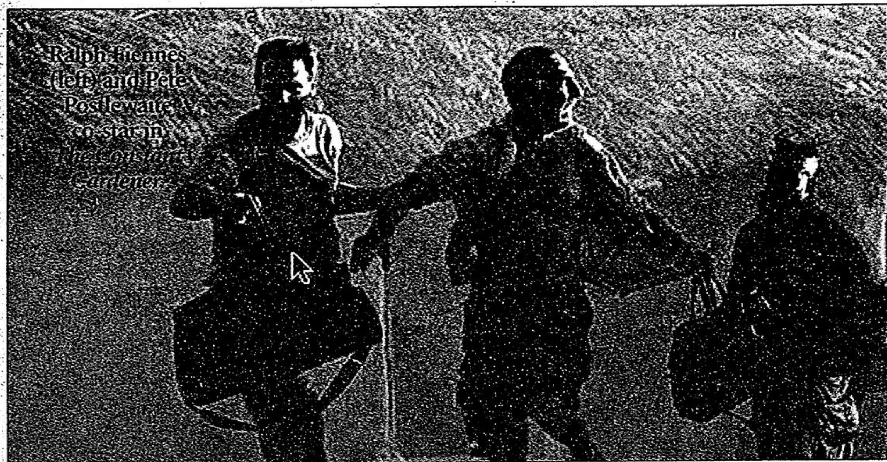
Ralph Fiennes (left) and Pete Postlewaite co-star in The Constant Gardener .