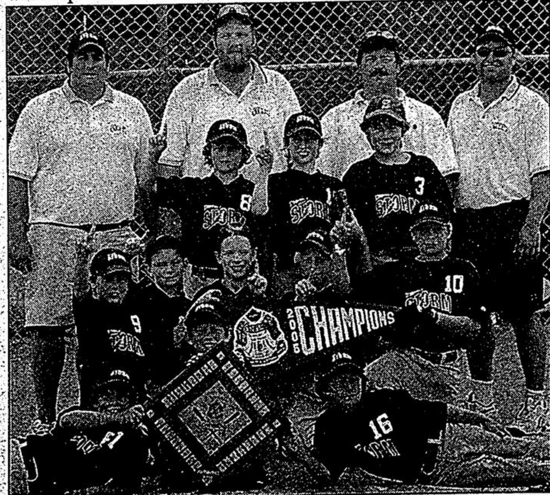
Members of the Stouffville Storm mites display the OASA banner and plaque they captured in Orleans Sunday with an 11-9 win over Kitchener in the final.

The win gave the Storm an automatic berth into the final.