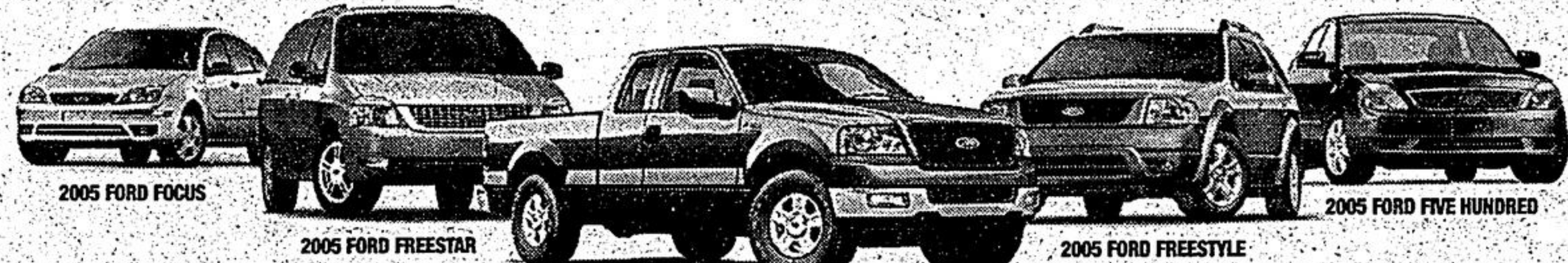
2005 FORD FOCUS