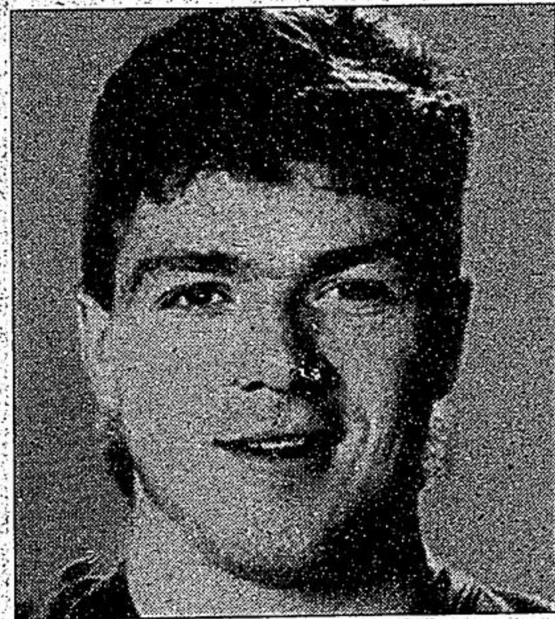
BRAD MAY: Is joining his fourth NHL club since making his professional debut in 1991-92 season with the Buffalo Sabres.