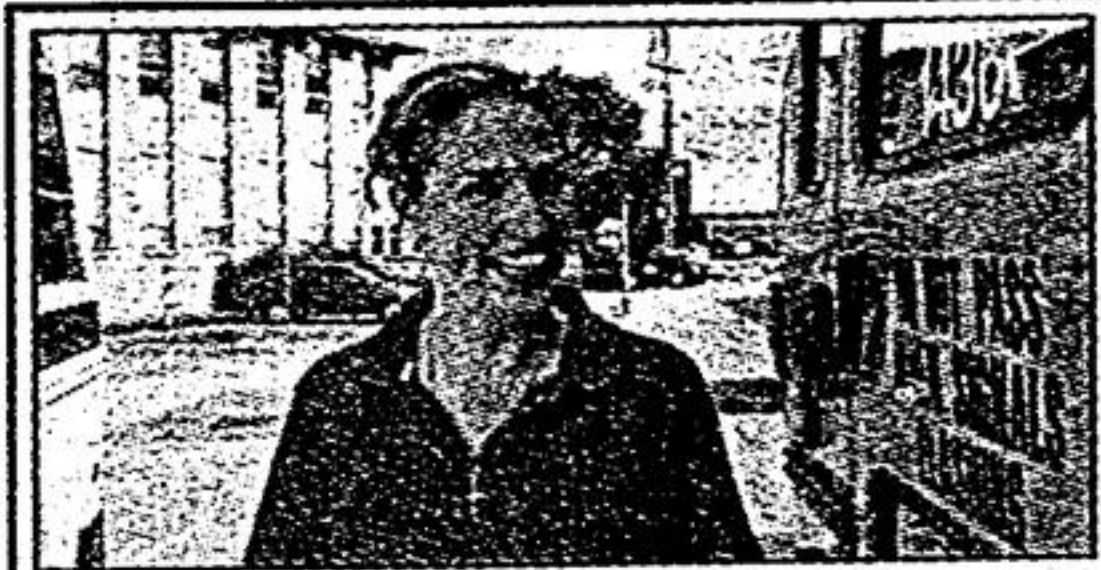
Enjoy The REWARDS of Working With Kids! Be A...