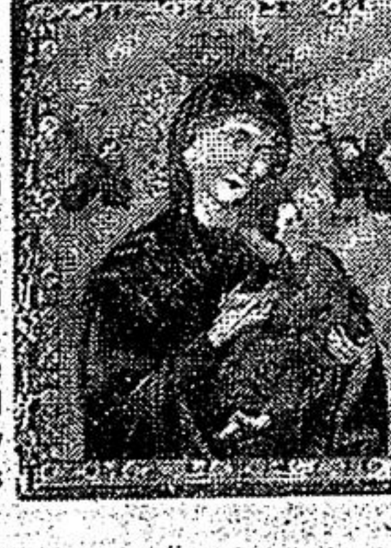
S.L. Our Mother of Perpetual Help

Holy Spirit Thou make me see everything and show me the way to reach my ideal. You who give the divine gift to forgive and forget the wrong that is done to me and who are in all instances of my life with me. I, in this short dialogue, want to thank You for everything and confirm once more that I never want to be separated from You no matter how great the material desire may be. I want to be with You and my loved ones in Your perpetual glory. Amen. Person must pray this 3 consecutive days without stating one's wish. After the 3rd day your wish will be granted no matter how difficult it may be. Promise to publish this as soon as your favor has been granted.