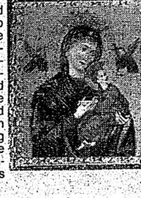
P.B. Our Mother of Perpetual Help

Holy Spirit Thou make me see everything and show me the way to reach my ideal. You who give the divine gift to forgive and forget the wrong that is done to me and who are in all instances of my life with me. I, in this short dialogue, want to thank You for everything and confirm once more that I never want to be separated from You no matter how great the material desire may be. I want to be with You and my loved ones in Your perpetual glory. Amen. Person must pray this 3 consecutive days without stating one's wish. After the 3rd day your wish will be granted no matter how difficult it may be. Promise to publish this as soon as your favor has been granted.