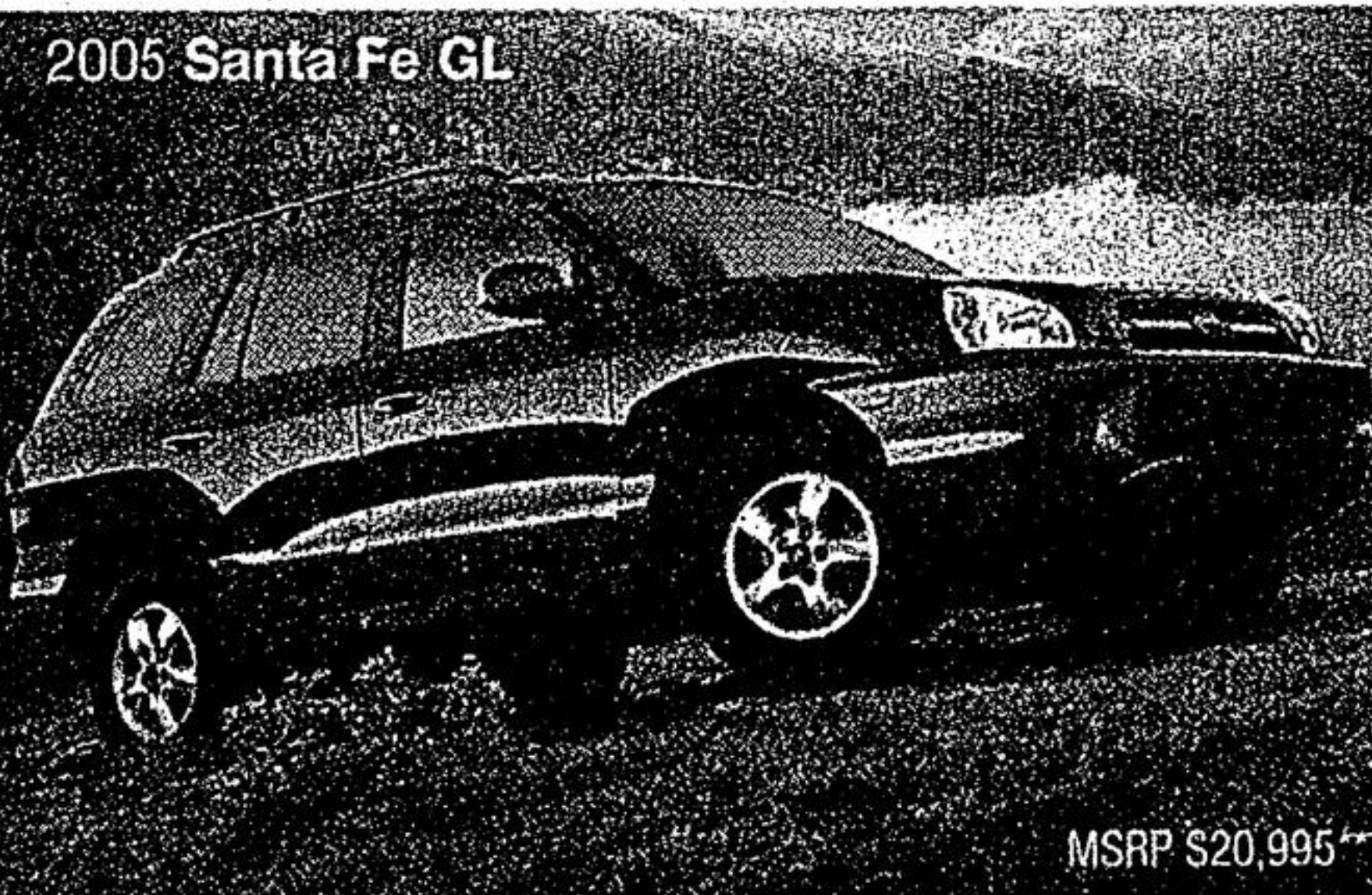
2005 Santa Fe GL

per mo./60 mos. $1,595 Down Payment $0 Security Deposit Freight & P.D.E. incl.