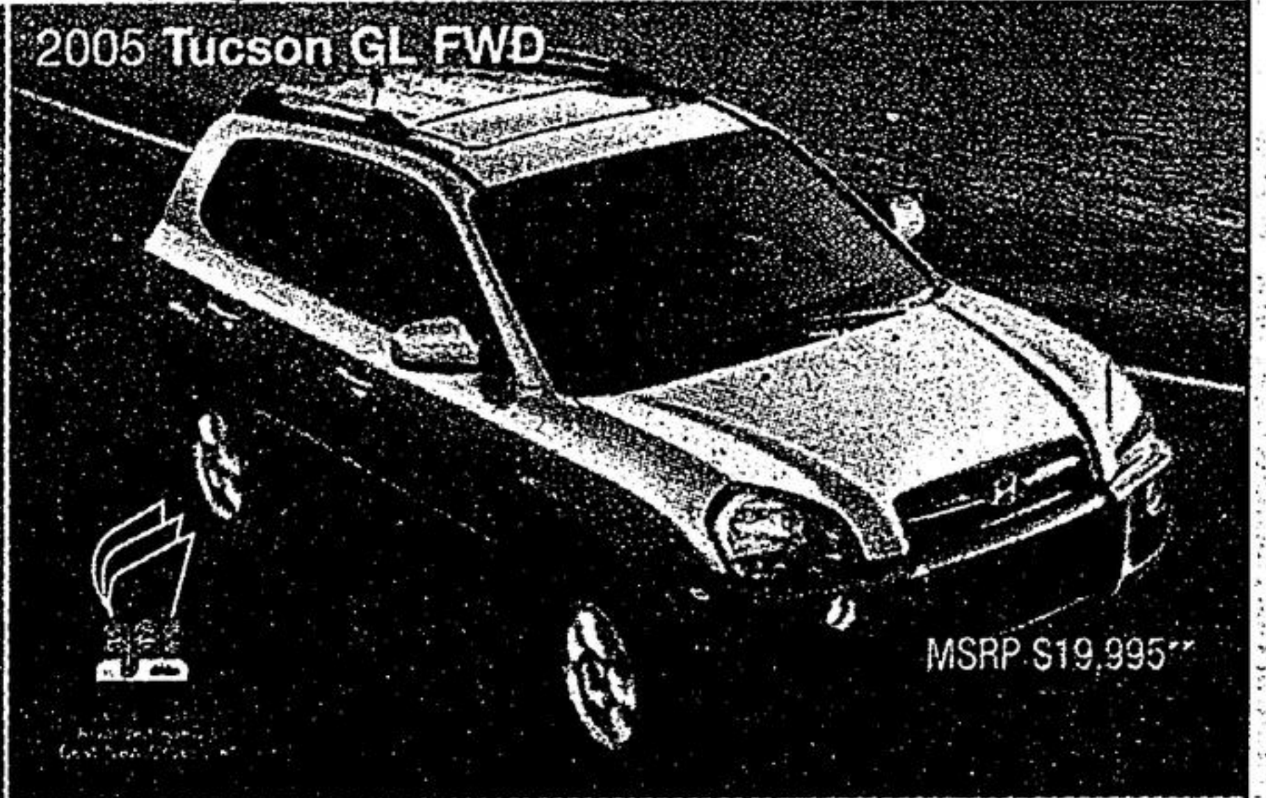
2005 Tucson GL FWD