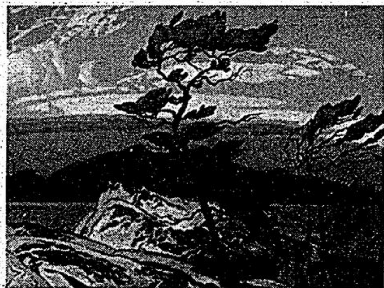
White Pine by A.J. Casson