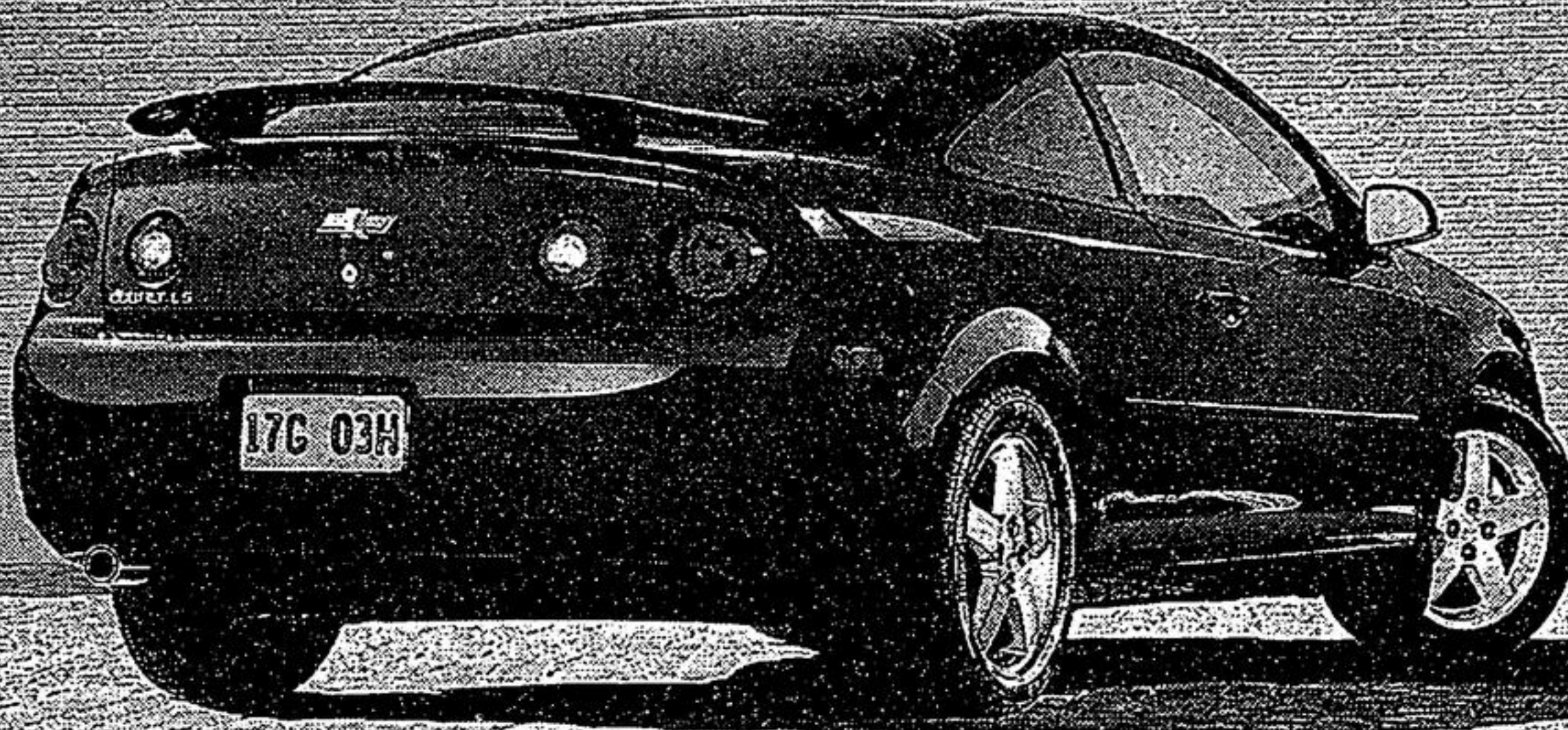
COBALT COUPE Cobalt Coupe LS with Sports Appearance Package and 16" Aluminum Wheels Shown

"CHEVY'S LATEST WARRIOR, ARMED TO BATTLE CIVICS AND COROLLAS." Automobile Magazine