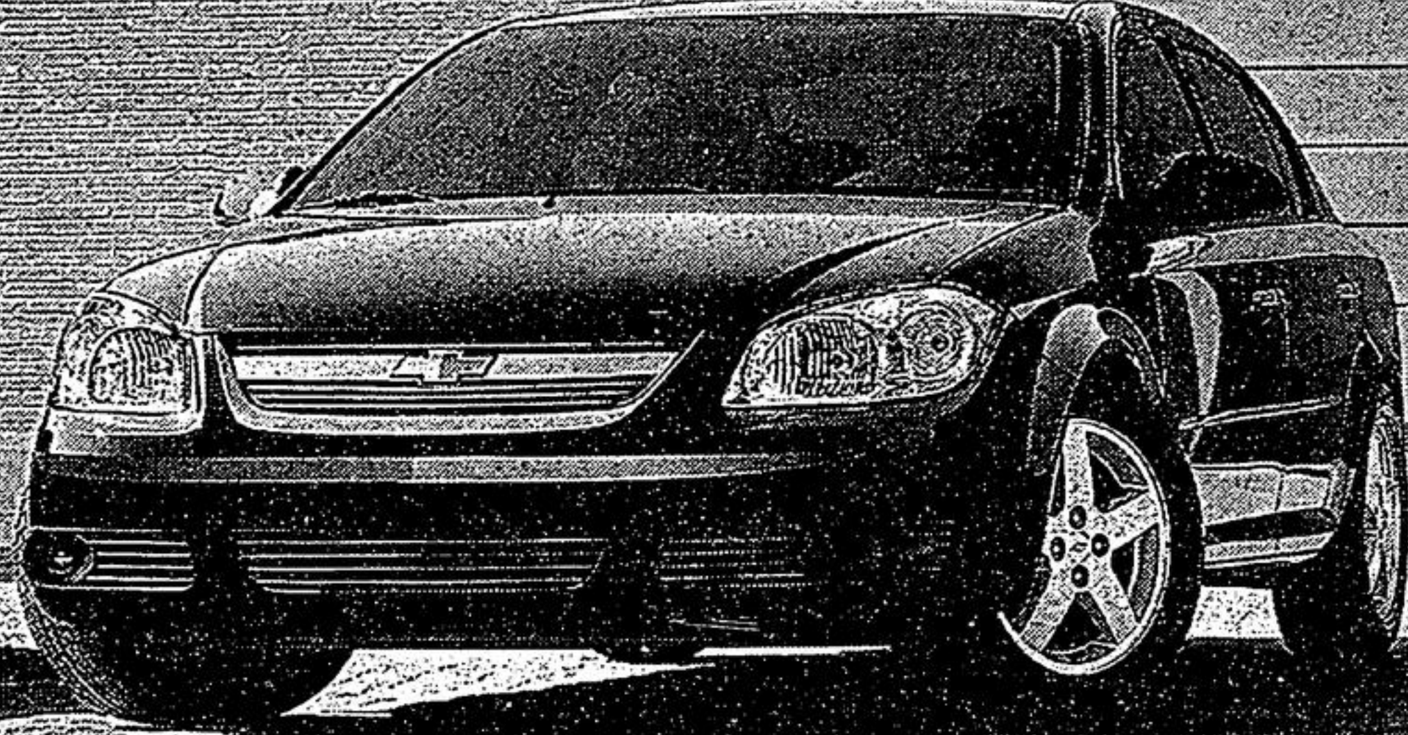
COBALT SEDAN Cobalt LT Sedan Shown