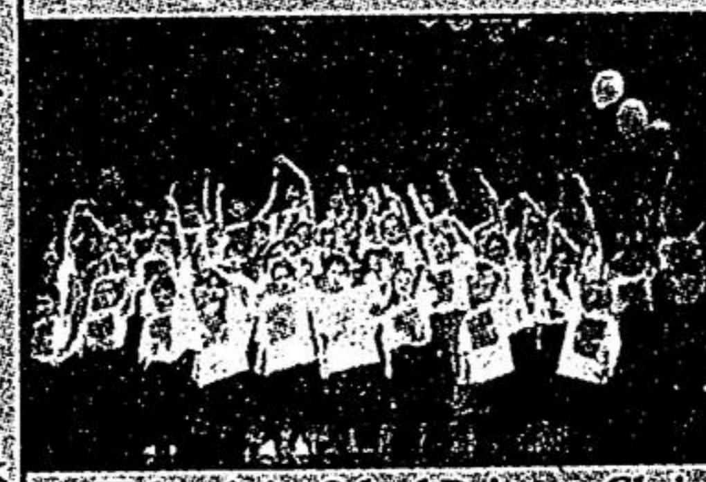
Holy Trinity School Primary Choir