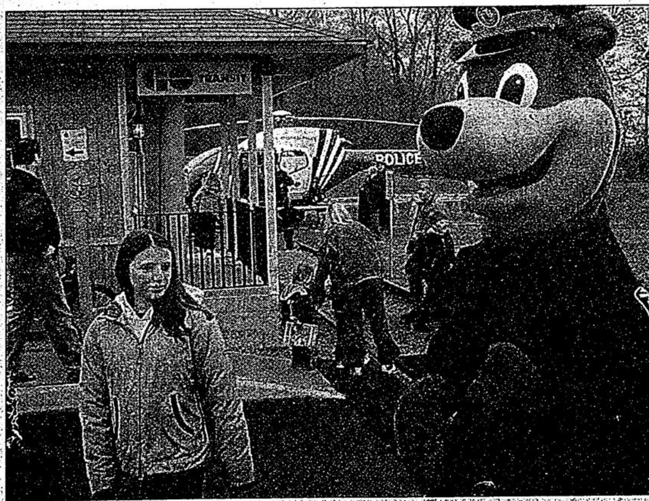
York Regional Police safety village mascot Bobby the Bear was among the attractions.