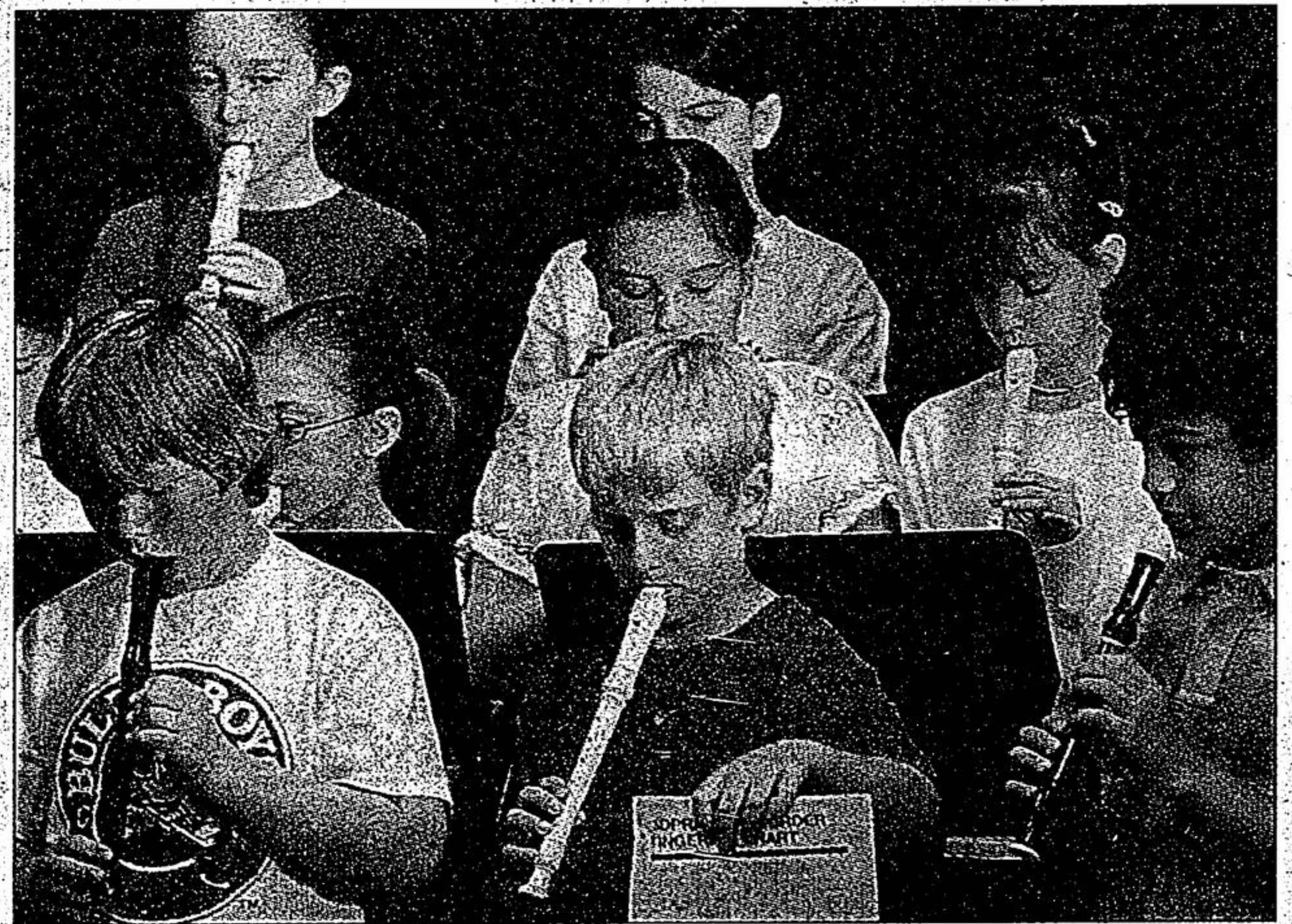
Grade 4 and 5 students play their recorders at the school concert.

NO → INTEREST ! NO → PAYMENTS ! NO → KM RESTRICTION ! → $$ DOWN ! TIL SUMMER ! → SECURITY DEPOSIT !