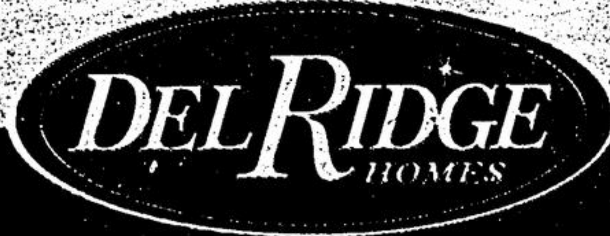
Illustration is artist's concept. Prices and specifications subject to change without notice. E&OE.