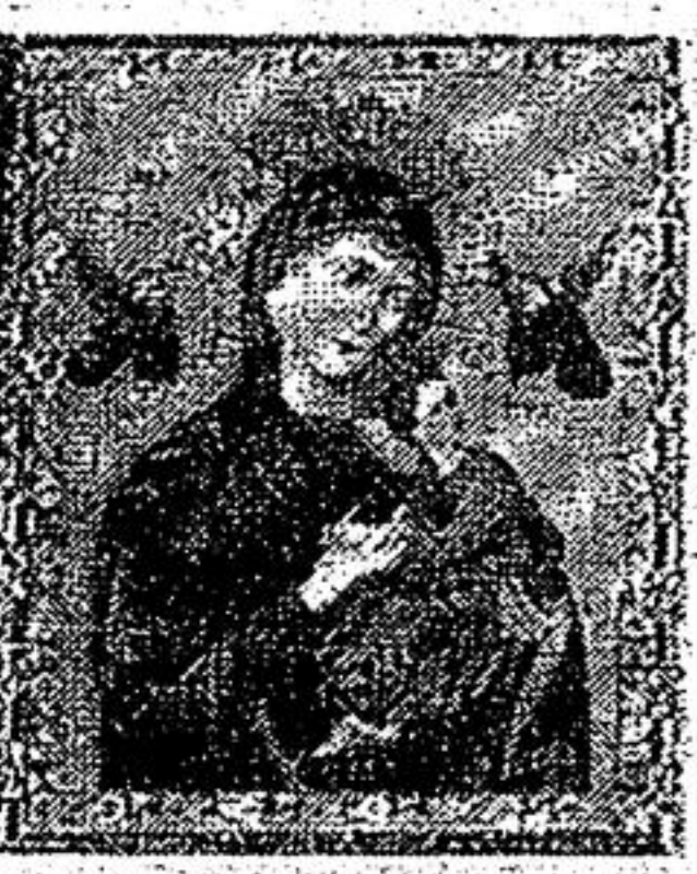
I.S. Our Mother of Perpetual Help

Holy Spirit Thou make me see everything and show me the way to reach my ideal. You who give the divine gift to forgive and forget the wrong that is done to me and who are in all instances of my life with me. I, in this short dialogue, want to thank You for everything and confirm once more that I never want to be separated from You no matter how great the material desire may be. I want to be with You and my loved ones in Your perpetual glory. Amen. Person must pray this 3 consecutive days without stating one's wish. After the 3rd day your wish will be granted no matter how difficult it may be. Promise to publish this as soon as your favor has been granted.