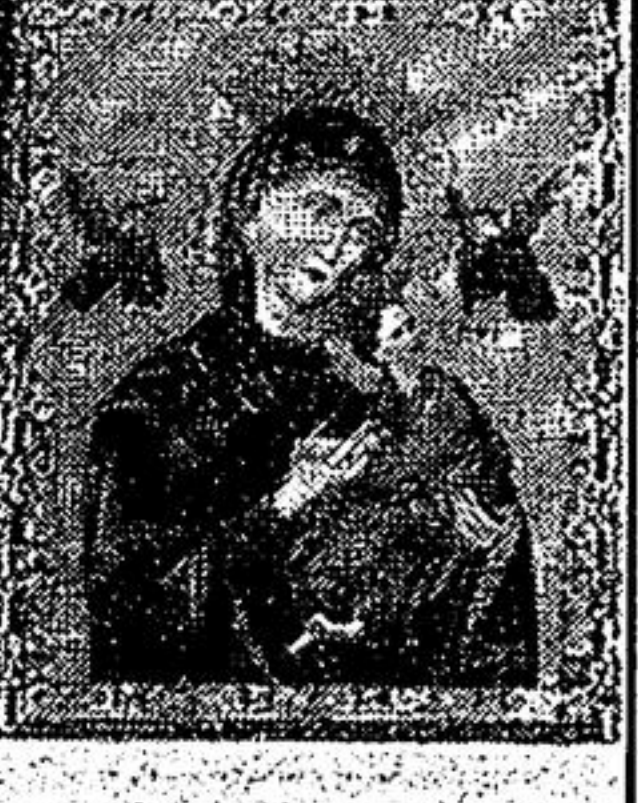
P.A. Our Mother of Perpetual Help

Holy Spirit Thou make me see everything and show me the way to reach my ideal. You who give the divine gift to forgive and forget the wrong that is done to me and who are in all instances of my life with me. I, in this short dialogue, want to thank You for everything and confirm once more that I never want to be separated from You no matter how great the material desire may be. I want to be with You and my loved ones in Your perpetual glory. Amen. Person must pray this 3 consecutive days without stating one's wish. After the 3rd day your wish will be granted no matter how difficult it may be. Promise to publish this as soon as your favor has been granted.