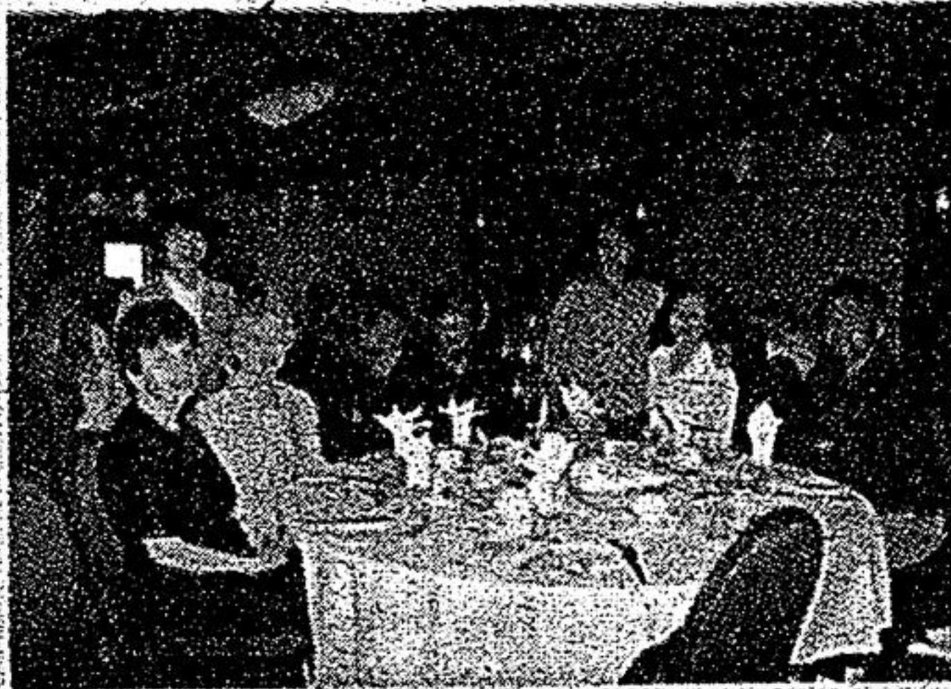
Enjoying lunch with fellow volunteers. A Volunteer Appreciation Luncheon was held on April 19, 2005 to acknowledge the contributions of our volunteers in the past year.

2005 is a special year as it marks the 15th anniversary of the opening of Markham Stouffville Hospital.