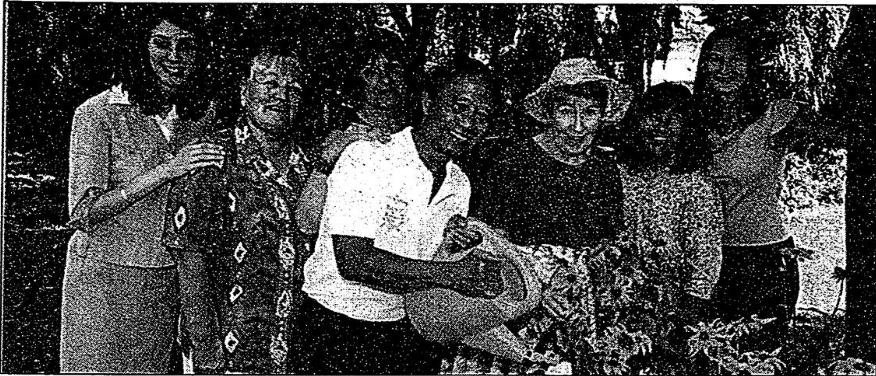
From page 23