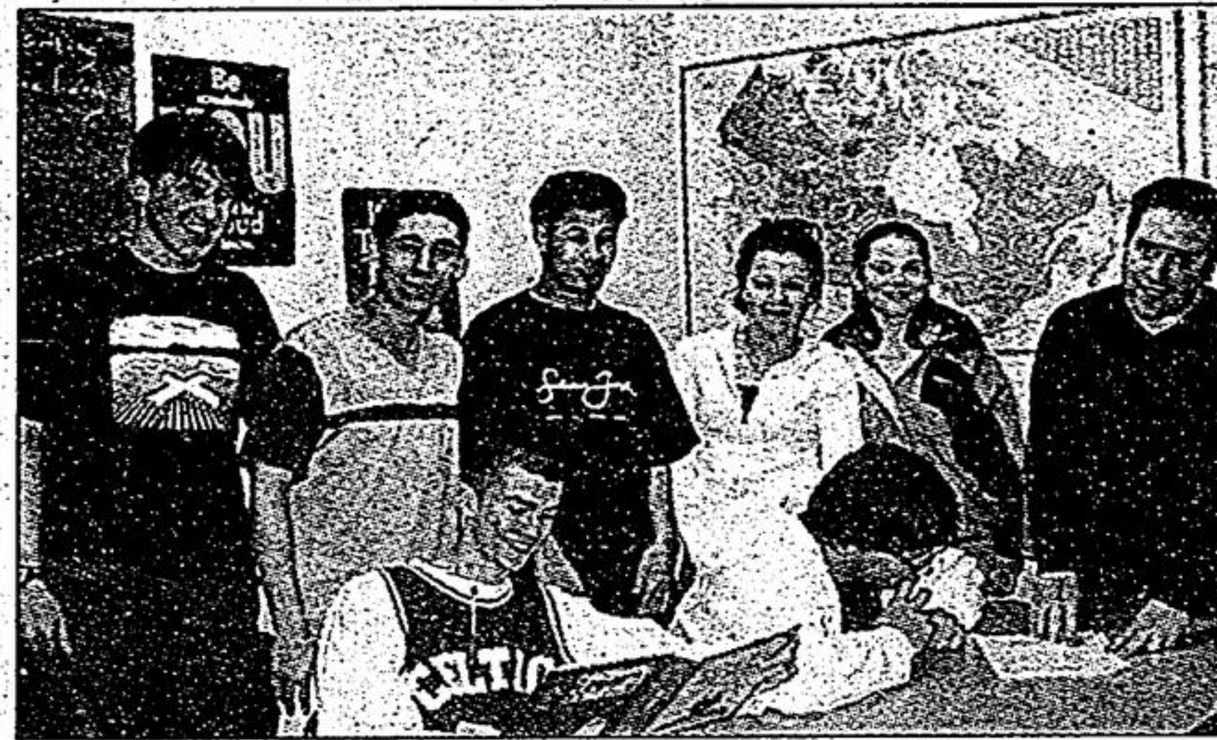
A place where students enjoy learning. Durham Secondary Academy New Term Starts April 25.

On April 12th, 2005 Durham Secondary Academy is opening its doors to the residents of Durham Region to come and see what Durham Secondary Academy is all about. Students and parents are welcome to come from 7 p.m. to 9 p.m..