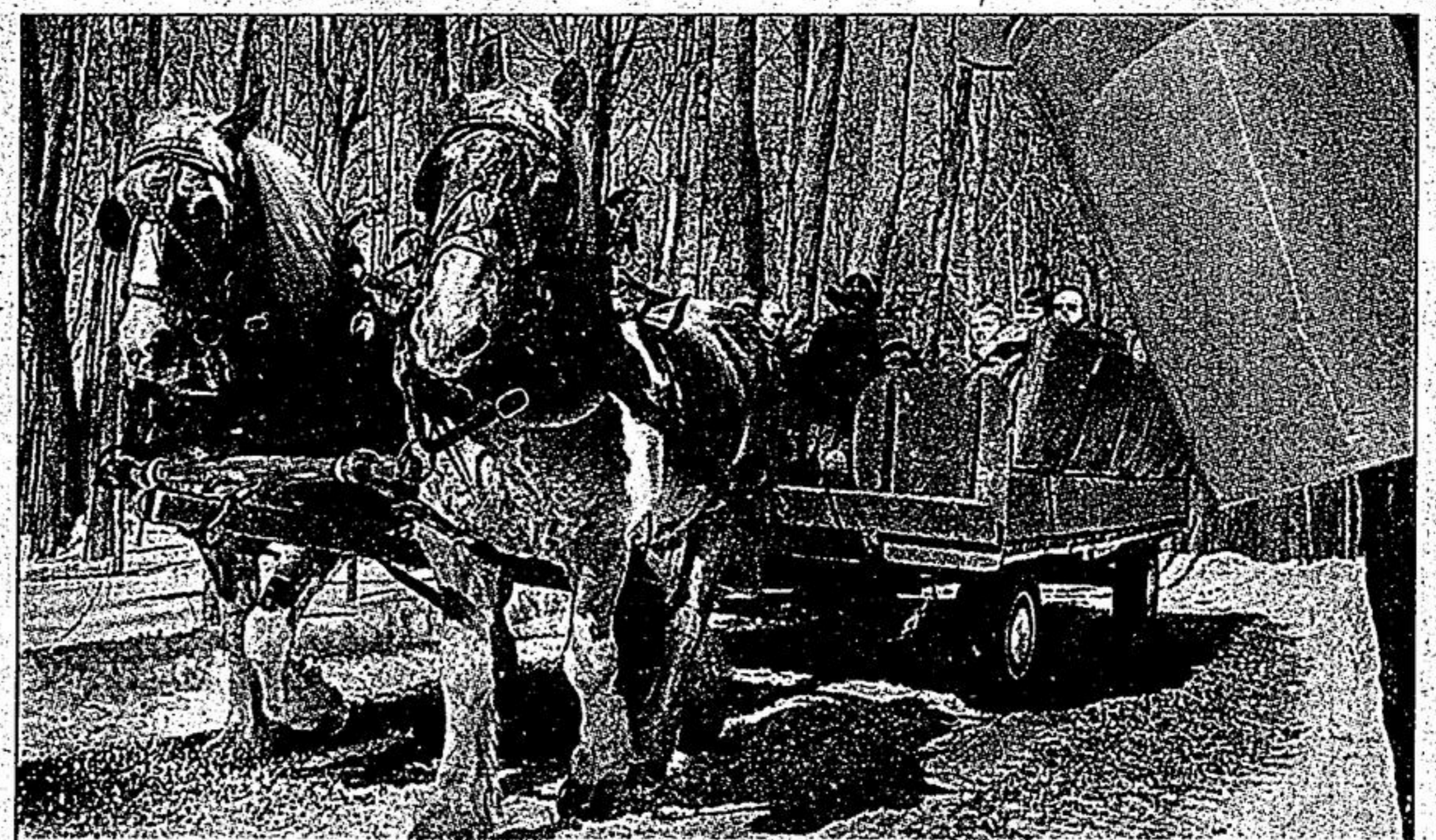
Horse-drawn sleigh rides from A&A Farm Yard Friends are among the attractions at the festival, which runs until April 3.

Karen Cavanagh and son Jake, 10, mix it up in the snow during the annual Enbridge Sugarbush Maple Syrup Festival at Bruce's Mill Conservation Area. The event features demonstrations, wagon rides, activities and, of course, pancakes and maple syrup. Admission is $7 for adults and $5 for students and seniors.