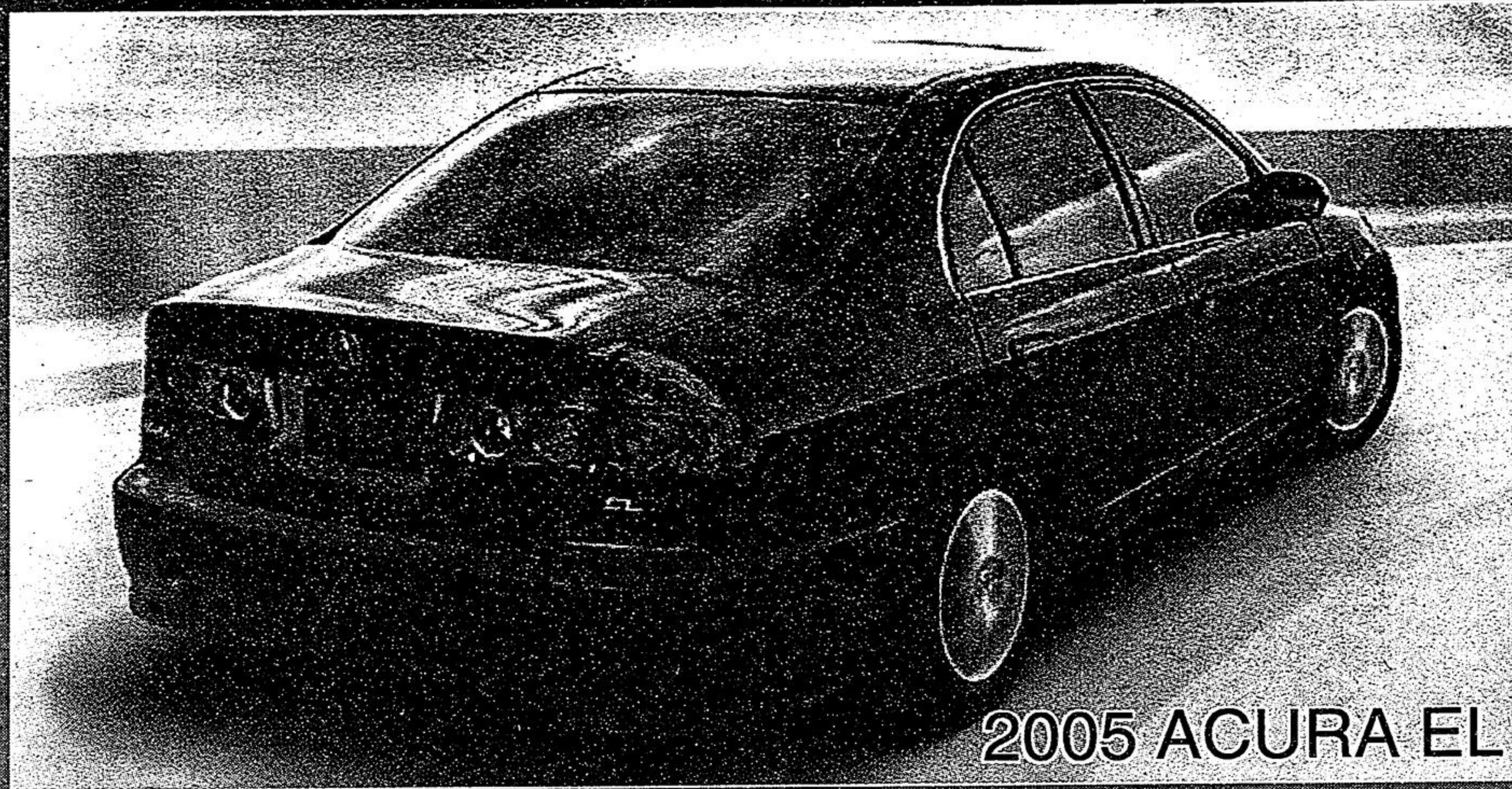
2005 ACURA EL

3.8% Lease & Finance Rate* 48 Month Term with $2,288 down