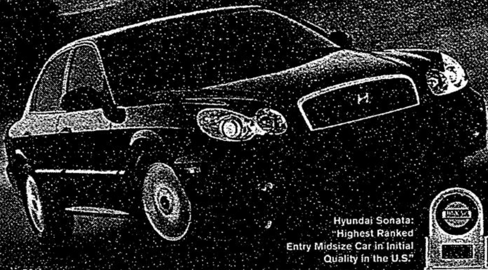
Hyundai Sonata: "Highest Ranked Entry Midsize Car in Initial Quality in the U.S."

0% Purchase Financing* up to 5 Years ON SELECTED MODELS