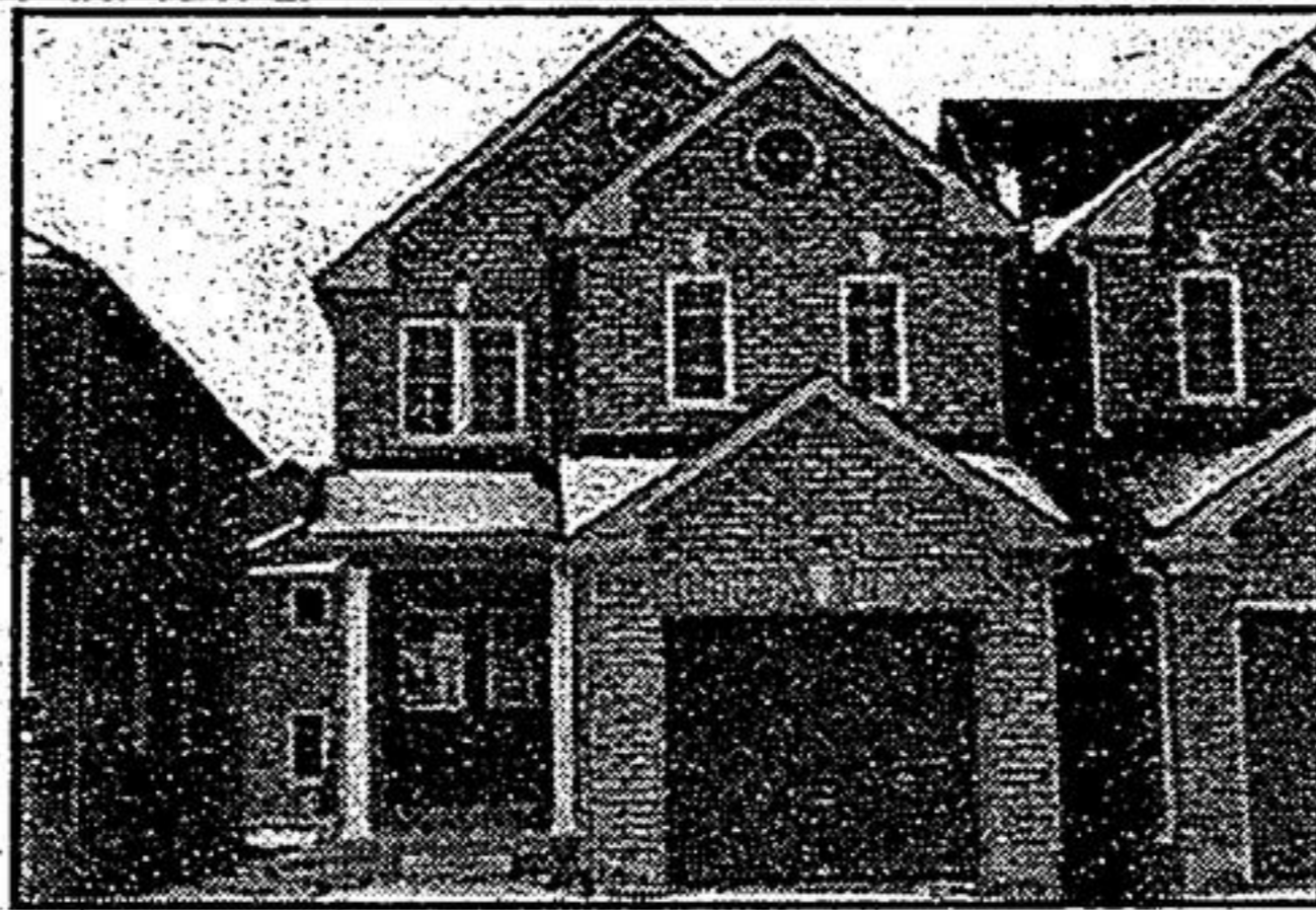
MARKHAM RD / STEELES