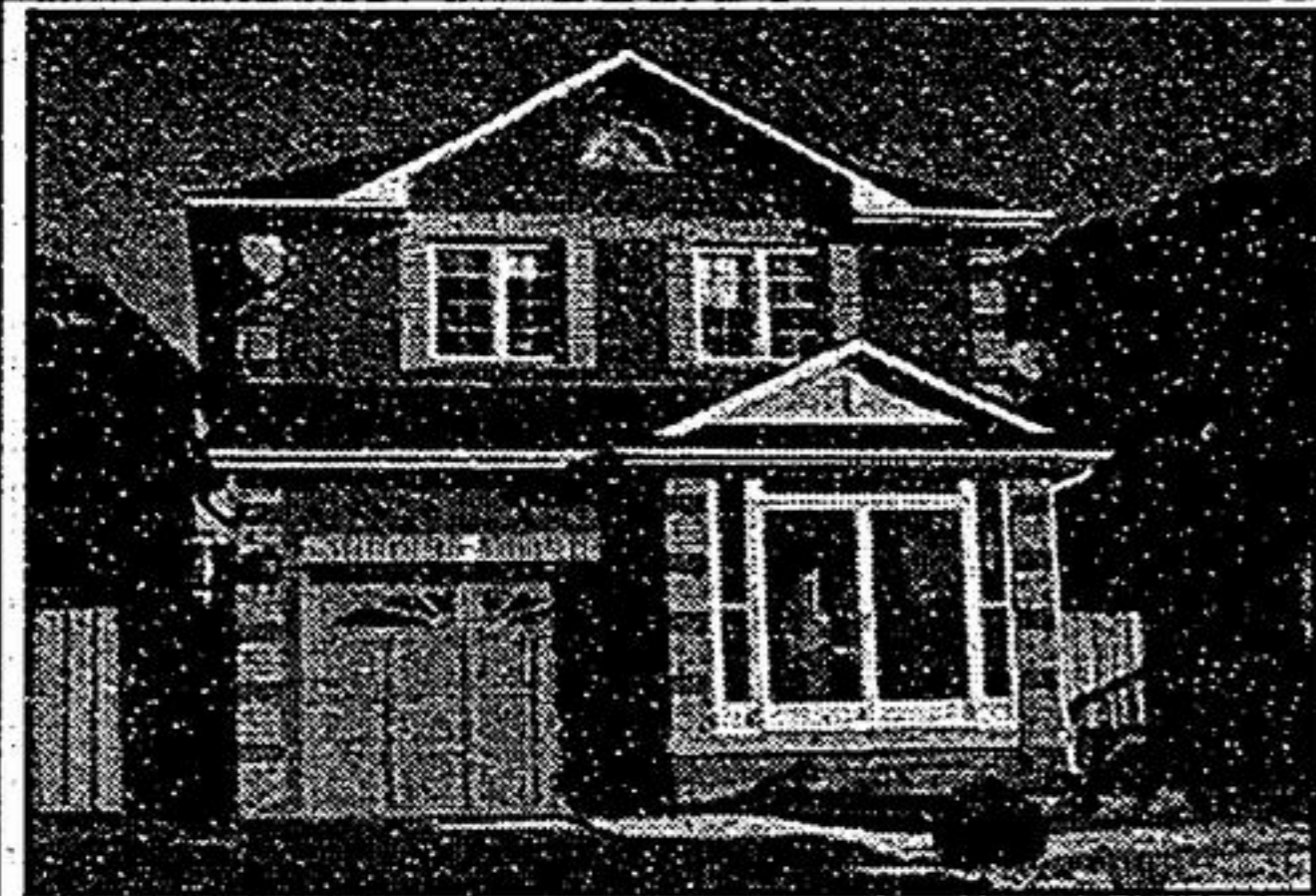
MARKHAM RD / 14TH AVE