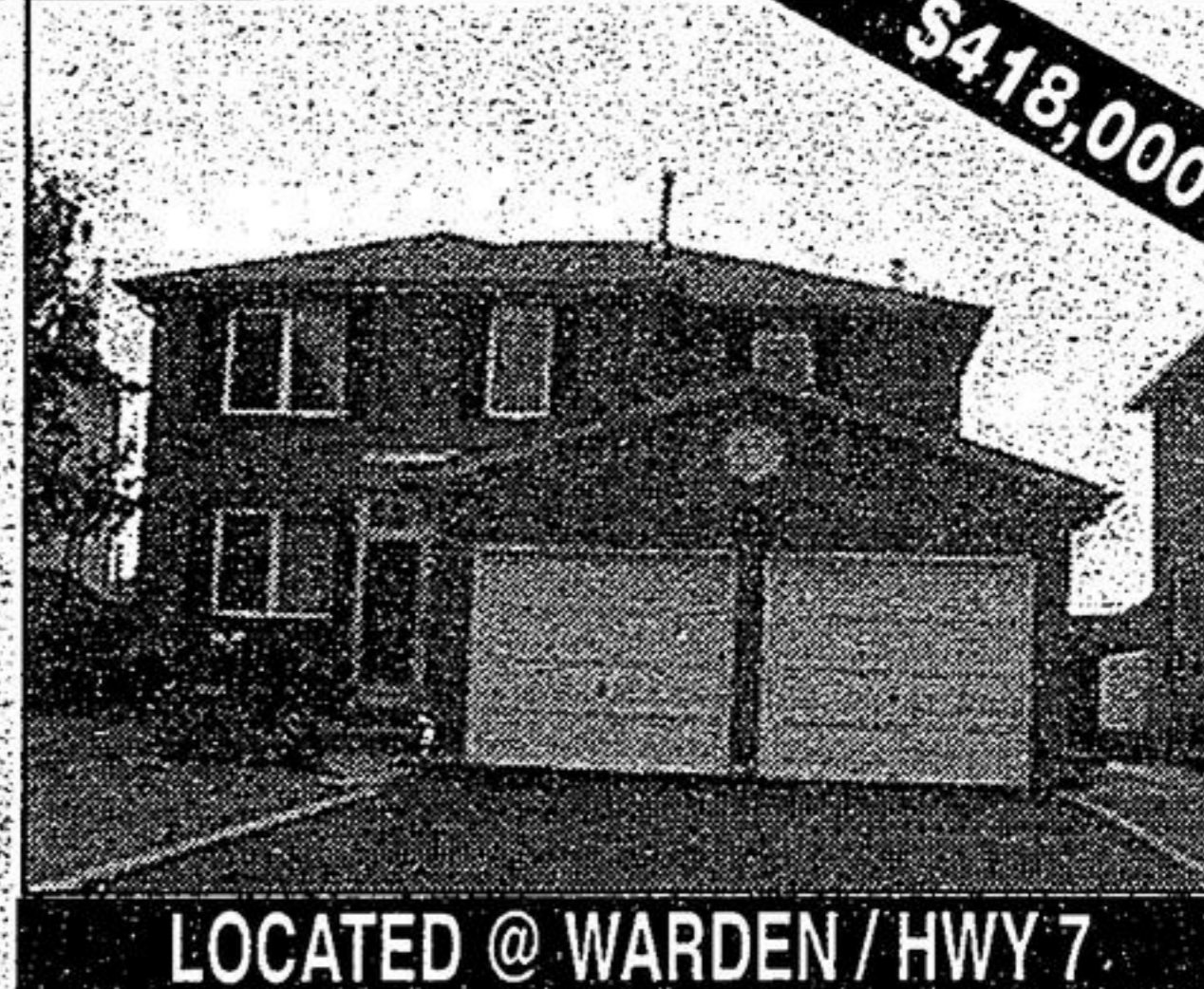
LOCATED @ WARDEN / HWY 7

2 car garage, next to park, bsmt apt w/2 bedrms, walk to Steeles