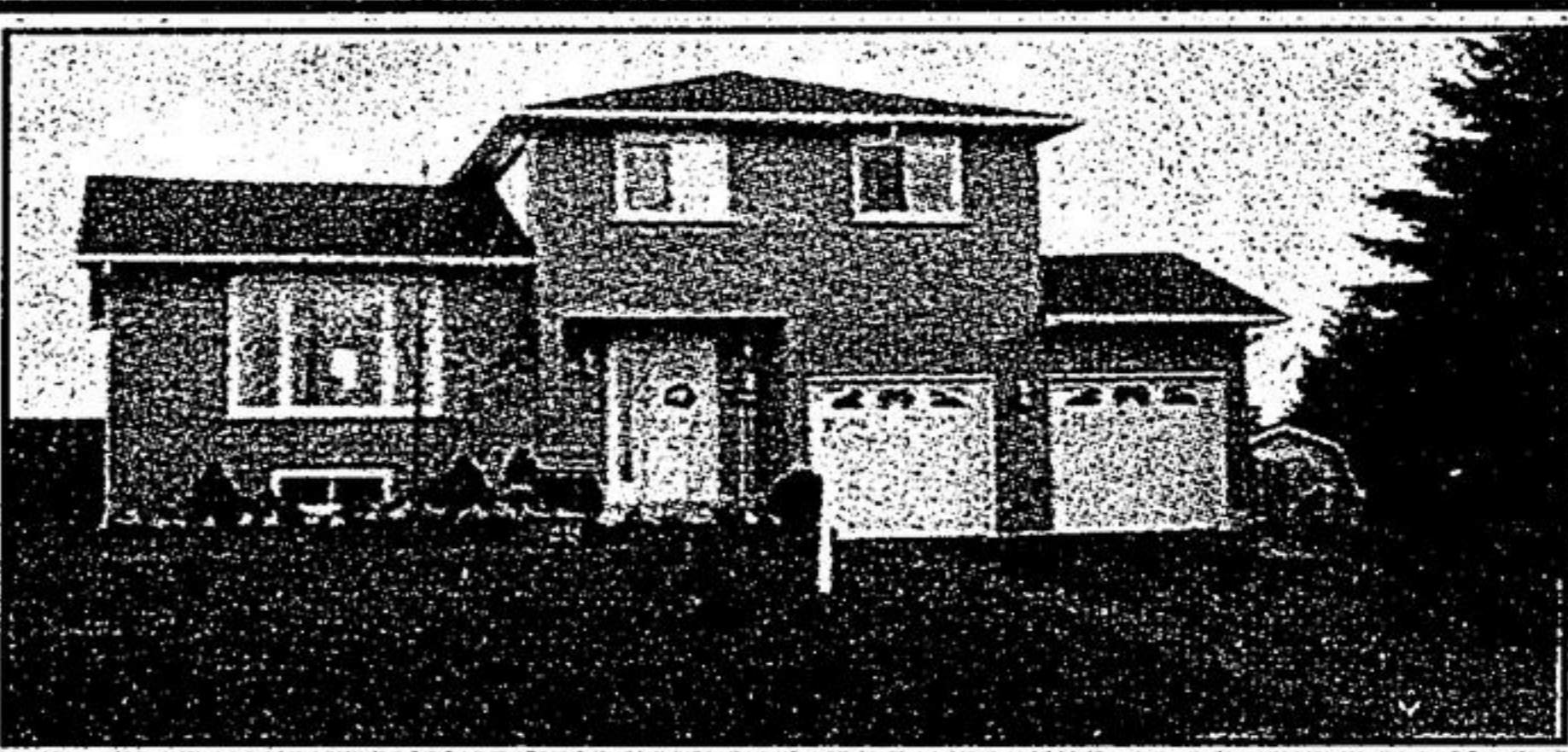
1/2 ACRE UXBRIDGE

RE/MAX Keswick realty inc. An Independent Member Broker (905) 476-4111/(416) 213-7496