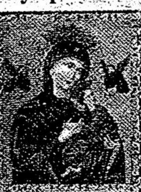
Our Mother of Perpetual Help