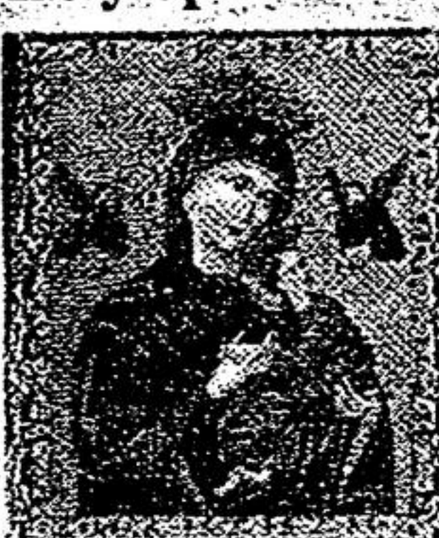
Our Mother of Perpetual Help