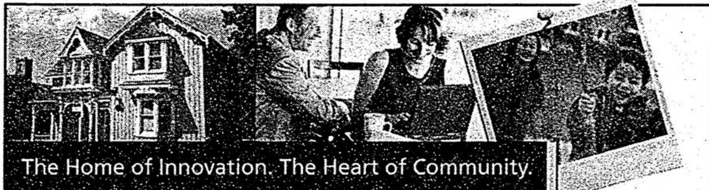
The Home of Innovation. The Heart of Community.

A unique blend of four thriving communities – Markham, Unionville, Milliken and Thornhill – the Town of Markham is a distinct and vibrant locale, the largest of nine communities in York Region and Canada's high-tech capital. Not your typical government job, a career with the Town of Markham, Fire and Emergency Services, is packed with challenge, change and the opportunity to make a difference. We offer numerous employment prospects and a wide range of benefit and wellness programs in a stimulating and forward-thinking work environment.