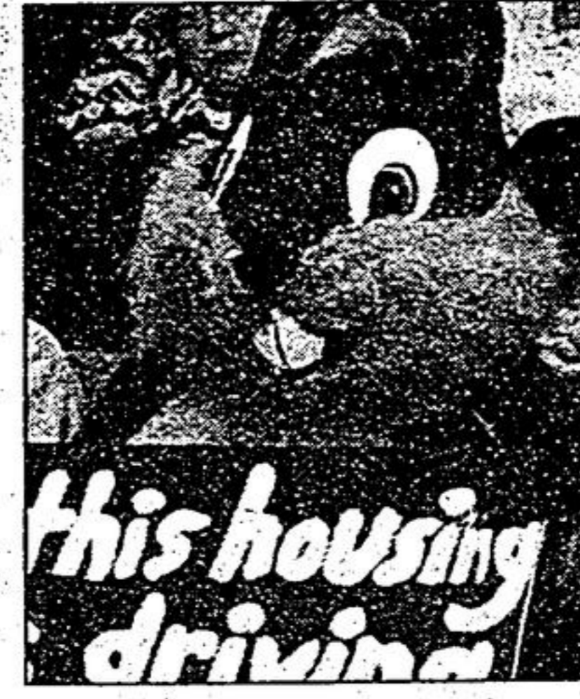
The Tory chipmunk (left) is featured on greenbotch.ca, while the Save the Rouge Valley System mascot (right) was a fixture at moraine protests.