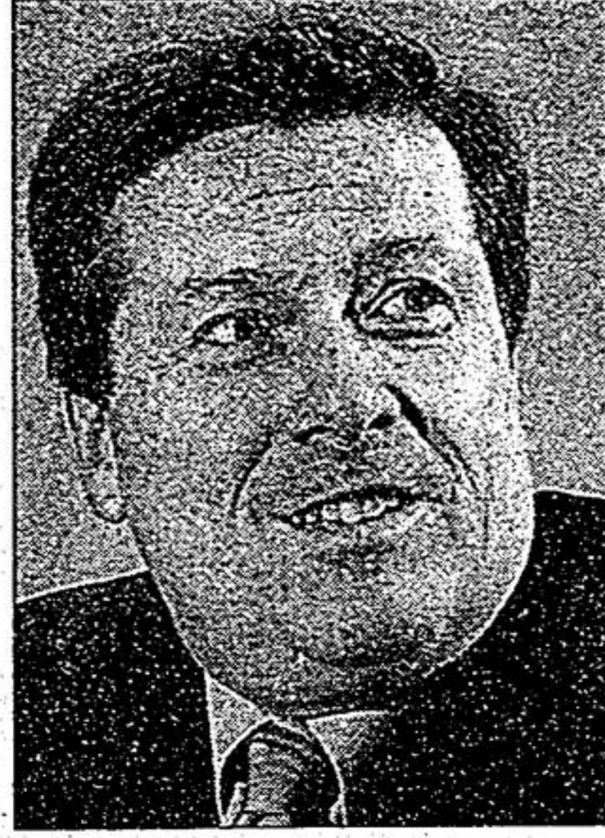
JOHN TORY: More time needed to investigate compensation for farmers, Conservative leader said.

The Conservatives aren't demanding farmers be paid for their land at development prices but some compensation is needed, Mr. Tory said. Accepting all or some recommendations of a provincial panel report on agriculture would be a good start, Mr. Tory said.