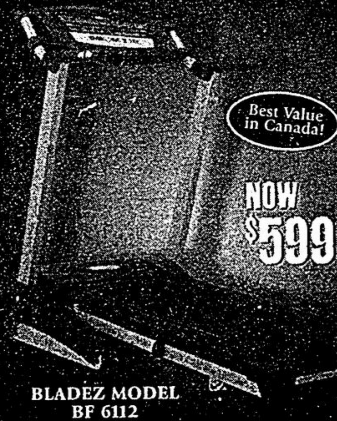
BLADEZ MODEL BF 6112