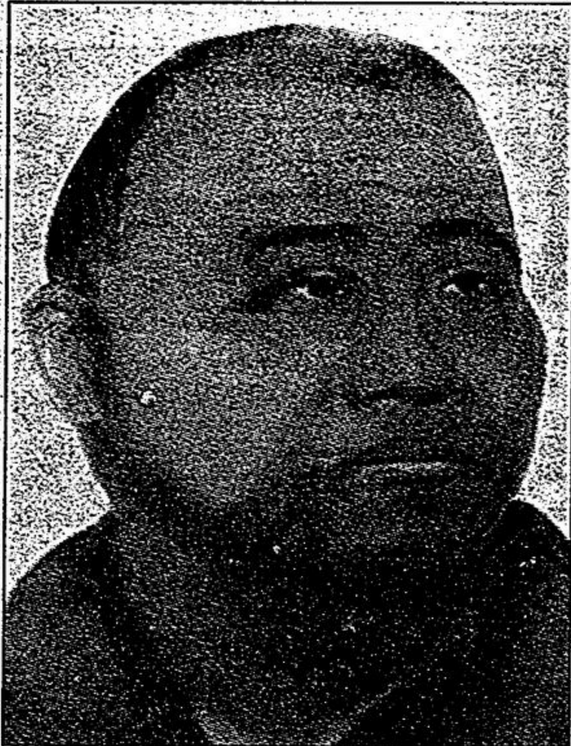
Police are looking for this man in connection with the Mirage Spa triple homicide in February.

A lack of public co-operation has also been incredibly frustrating for homicide