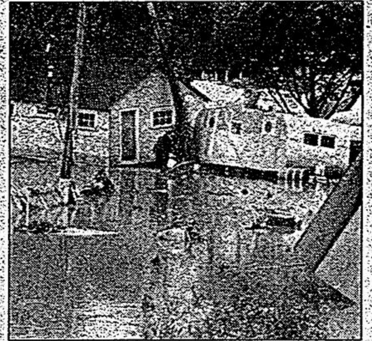
Flooding from Hurricane Hazel in '54.

Because it sat on high ground, Richmond Hill managed to escape the brunt of Hazel although it suffered