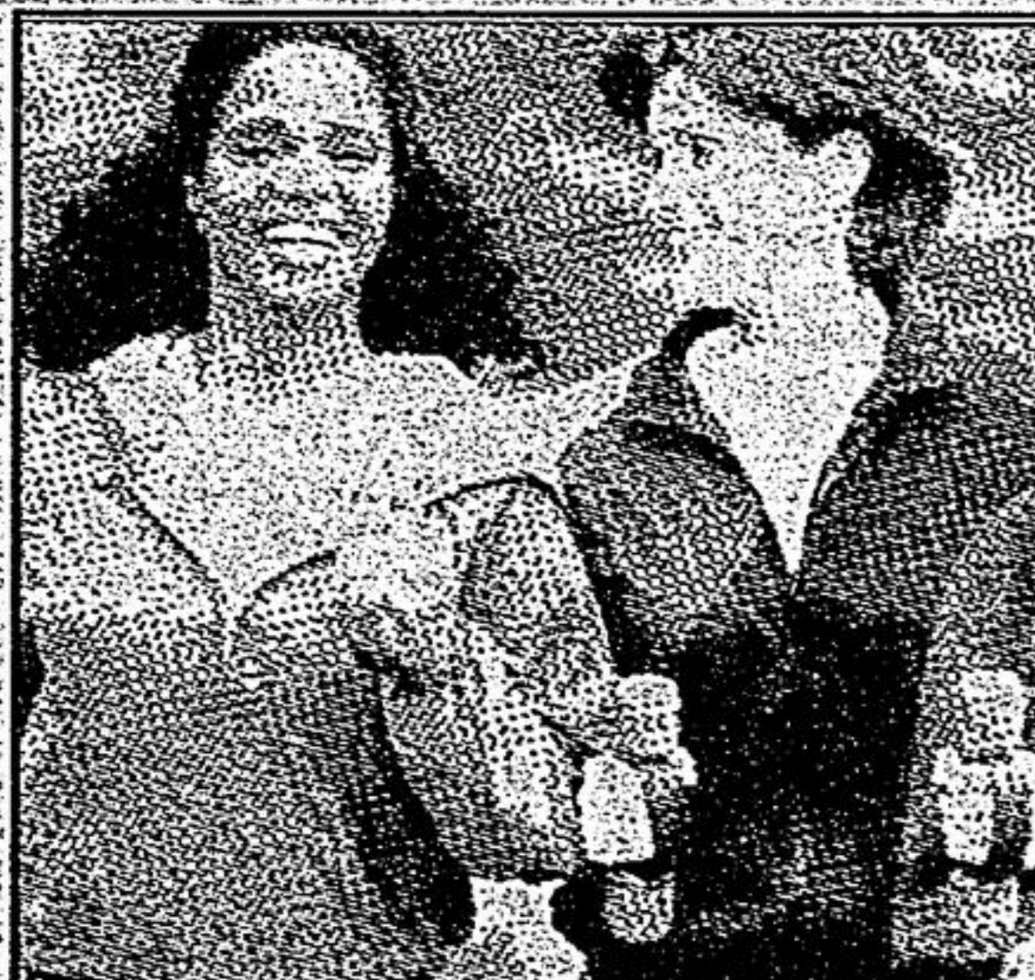
After Breast Surgery