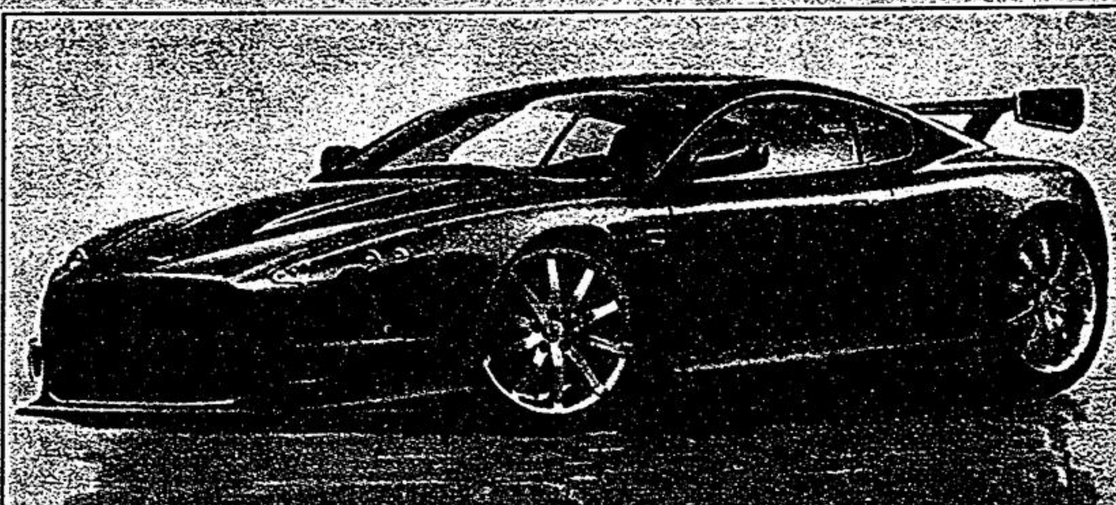
The first DB9 is being prepared now and will compete during 2005 in selected international sports car events.

Aston Martin's global dealer network is set to increase by 20 per cent over the next six months to support the serious growth plans the company has always maintained for its future.