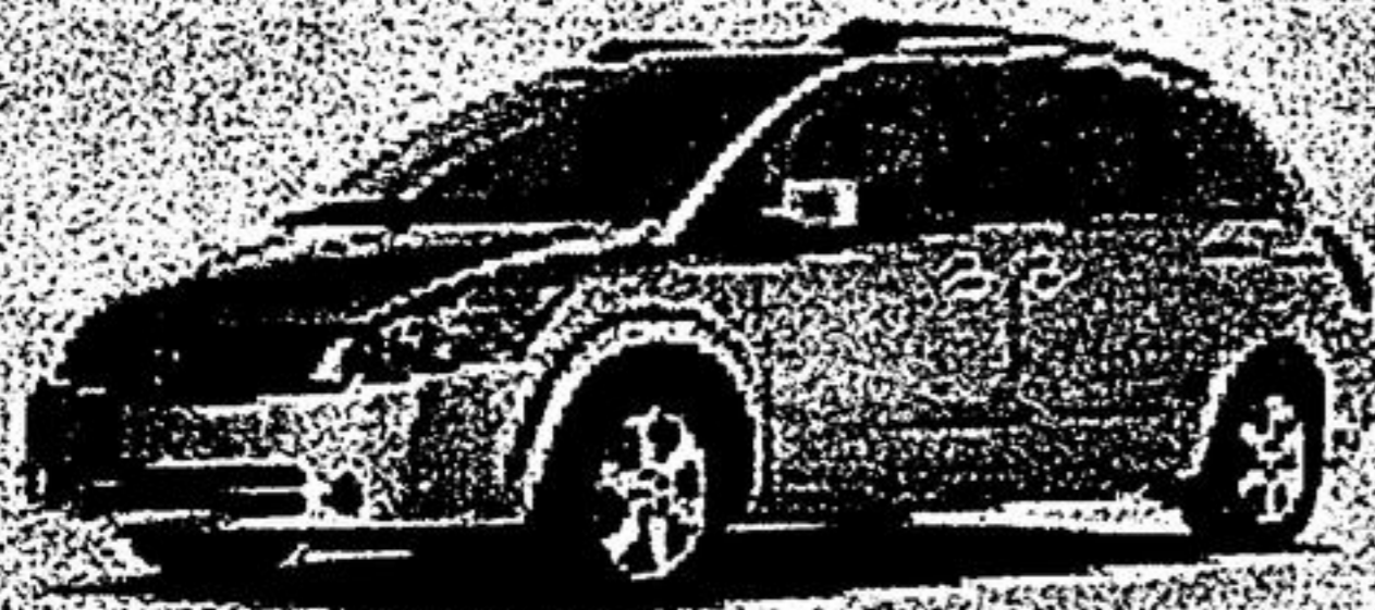
2004 QUEST SL/SE