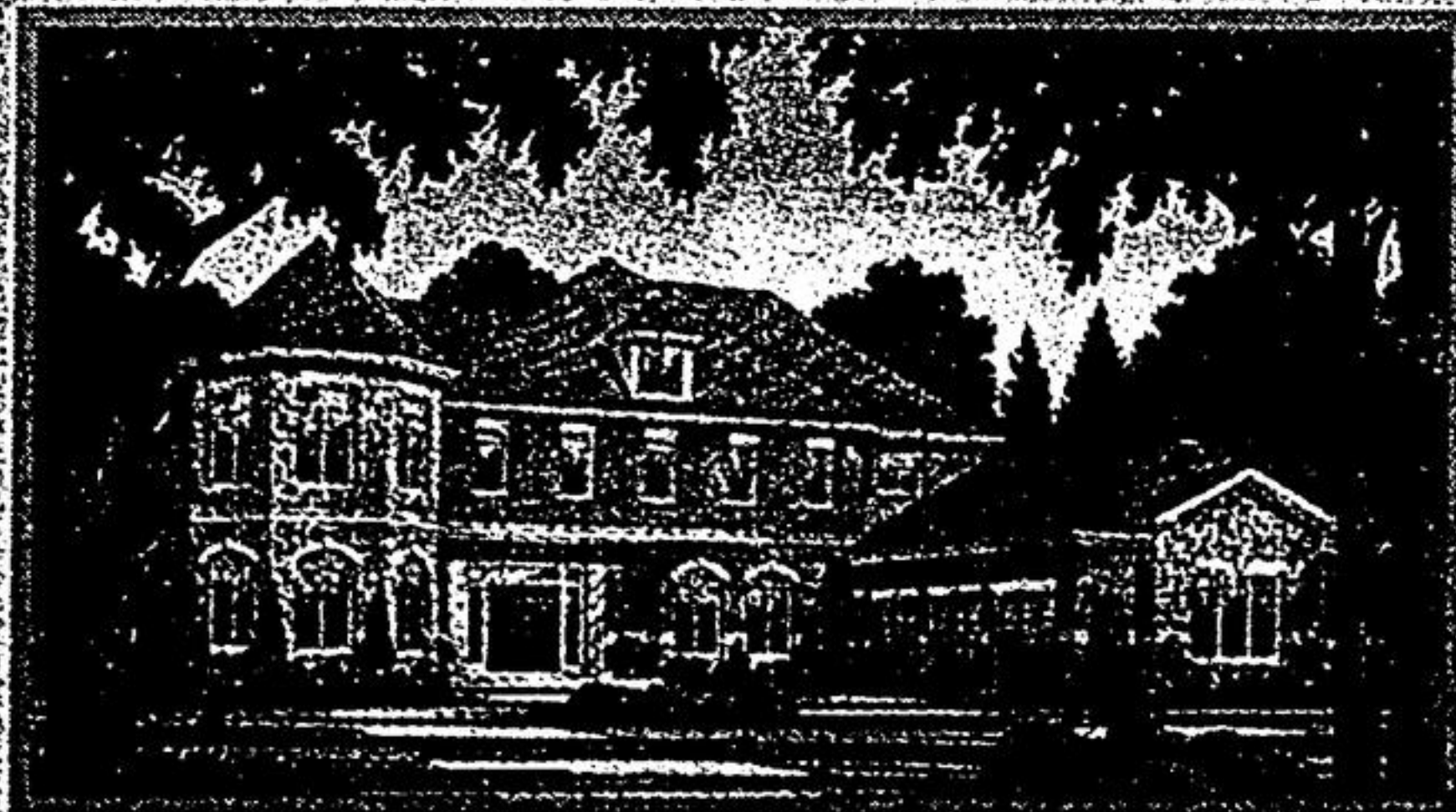
Maple Medley, Elevation A, 3,940 sq. ft.