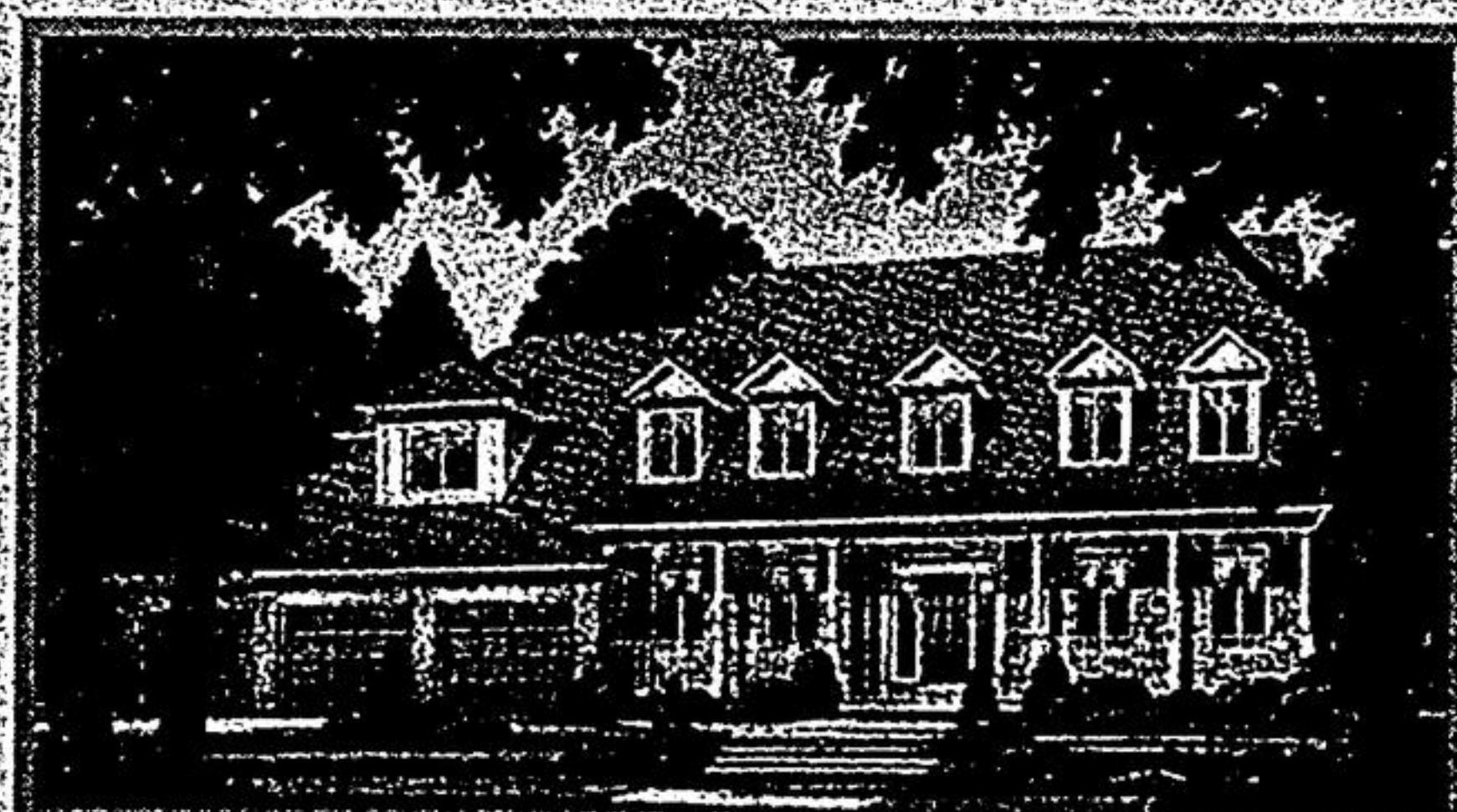
The Spanish Rose, Elevation B, 3,719 sq. ft.

Call 905-476-4783 or 905-640-6455 Fax 905-476-2576