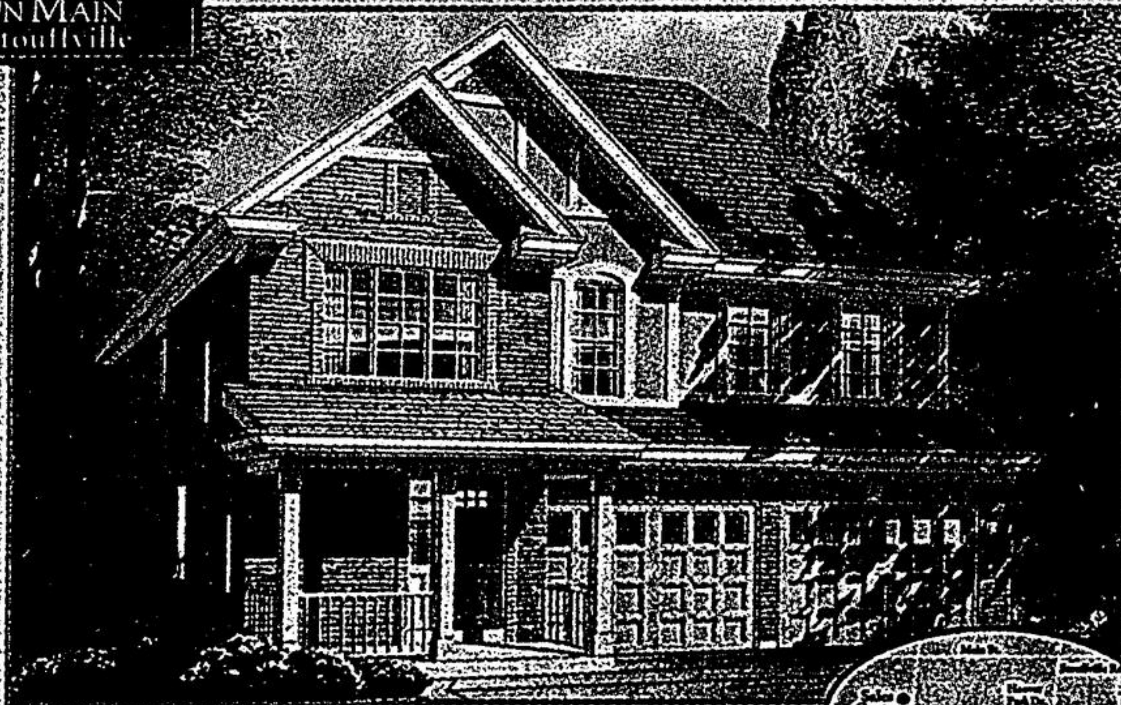
The Clairbrooke 'C', 1,774 sq.ft. $294,990