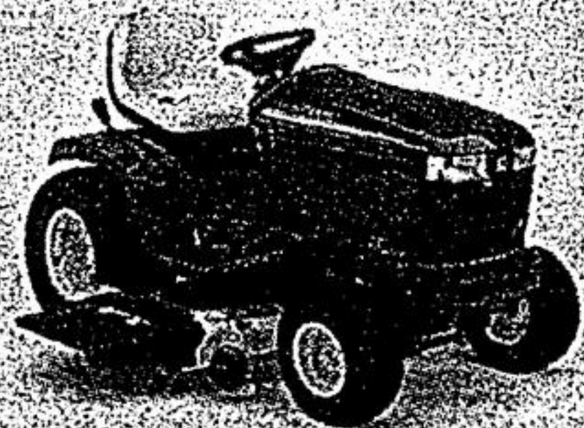
GT245 Tractor 20-hp OHV, Twin-Touch auto drive, electric PTO, cuts 54"*. GT-Series starting as low as $7,069!