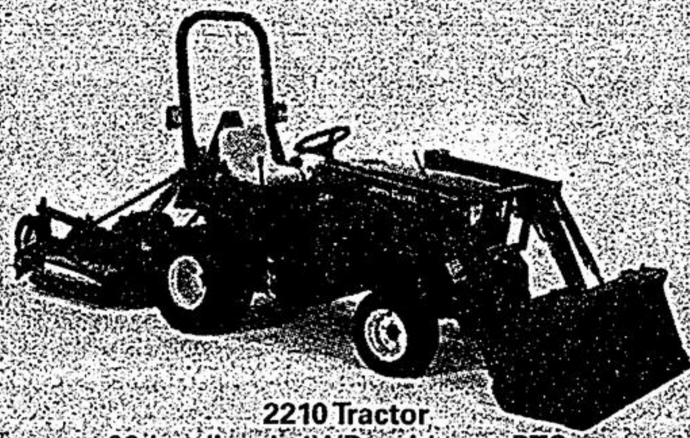
2210 Tractor 23-hp diesel, 4WD, mid-rear PTOs and Category 1, 3-point hitch**. 2210 starting as low as $14,993!

RIGHT NOW, NO PAYMENTS AND NO INTEREST FOR 150 DAYS.*