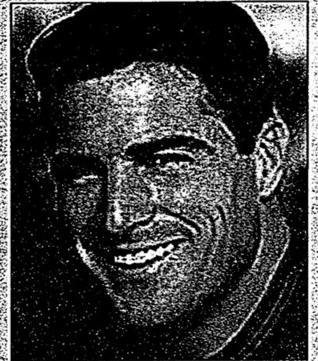
GEORGE EADS: Nick Stokes from television's CSI here to play Evel Knievel in made-for-TV movie.

Mr. Knievel began his daredevil career in 1965, forming a troupe called Evel Knievel Motorcycle Daredevils. He barnstormed the United States, performing automobile and motorcycle stunts for anyone who would pay him.