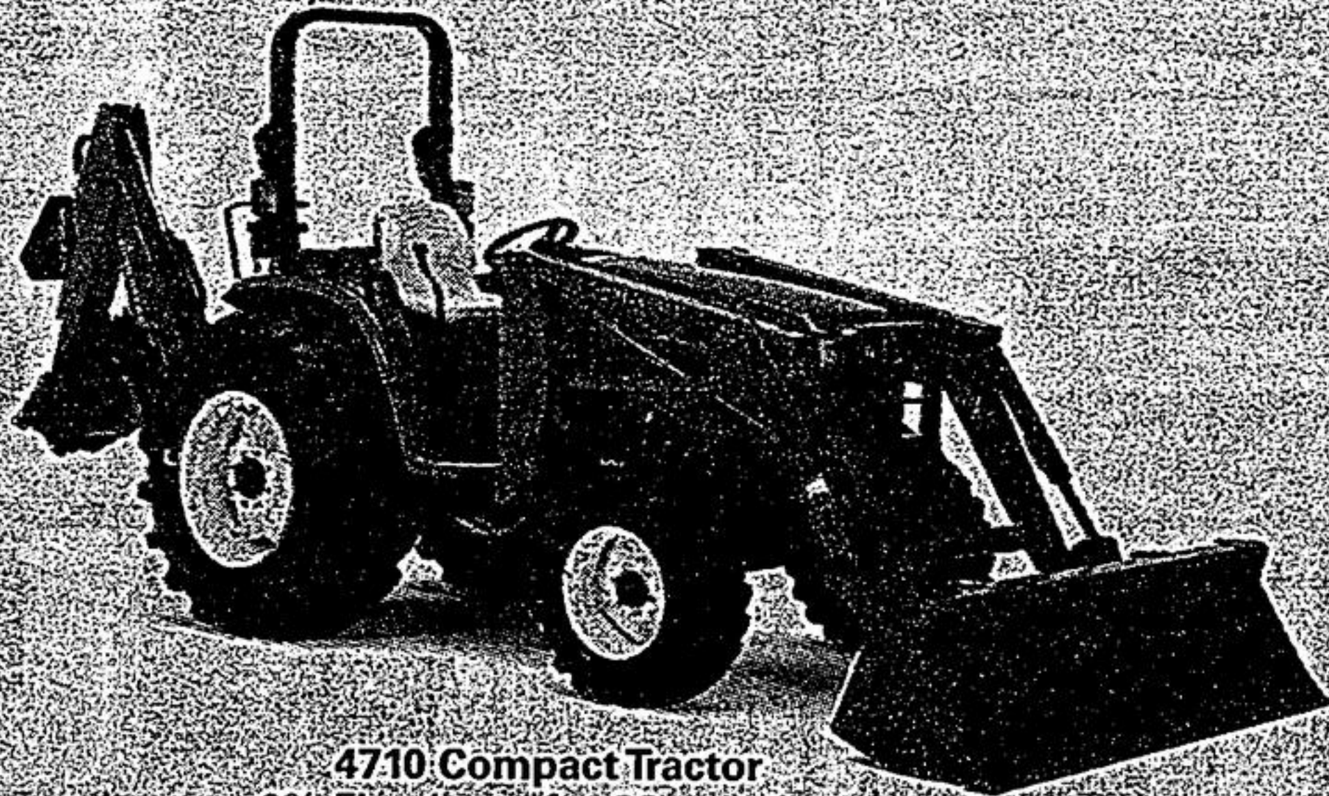
4710 Compact Tractor 0% Fixed rate for 36 months†