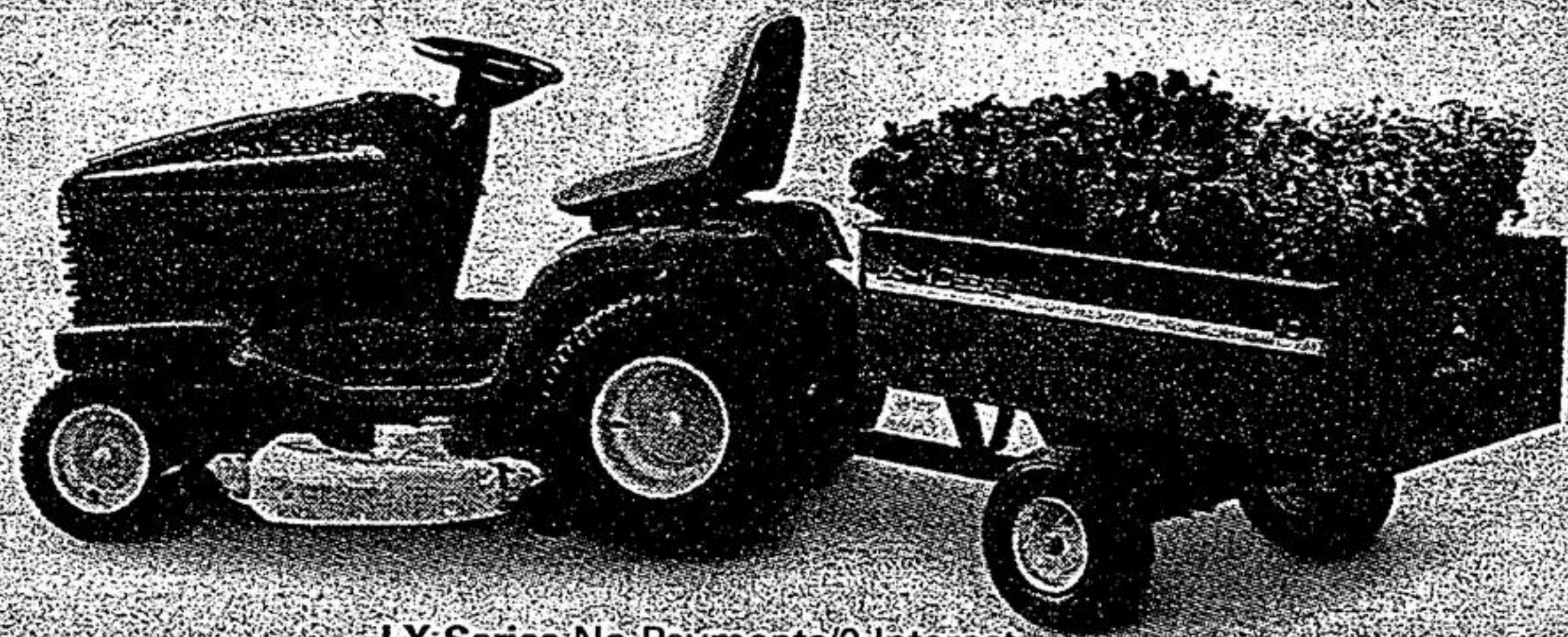
LX Series No Payments/0 Interest until January 31, 2005 Free utility cart with purchase until April 30, 2005