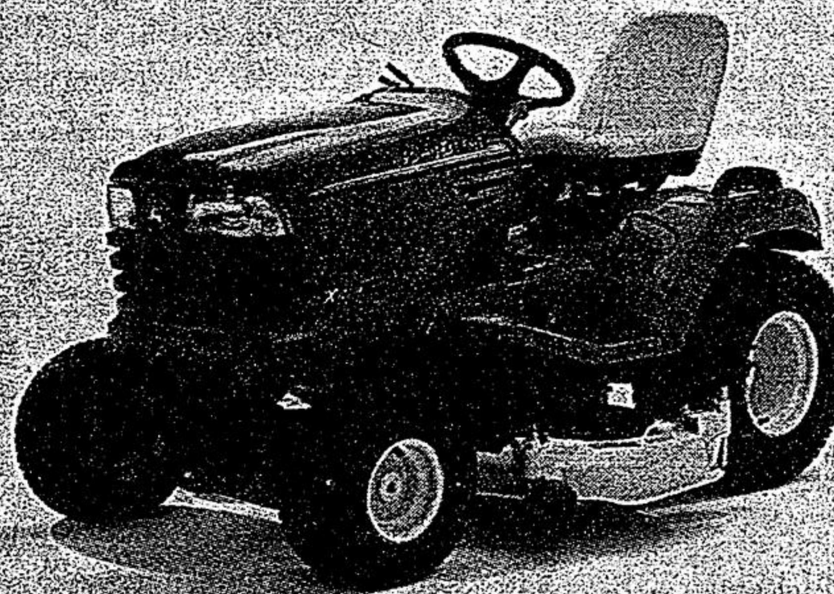
Stop by and check out our selection of X485 up to $1500 off*