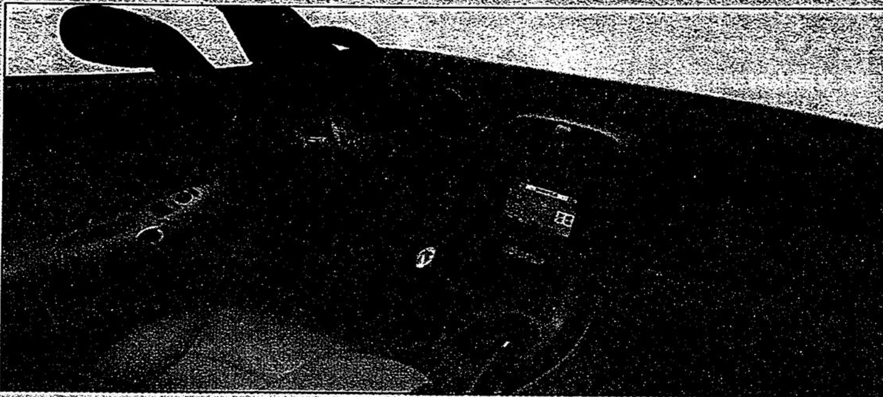
(LEFT) Anodized aluminum accents the interior in key functional areas, such as the manual shift knob and door-release buttons. The design is cleaner and less cluttered.