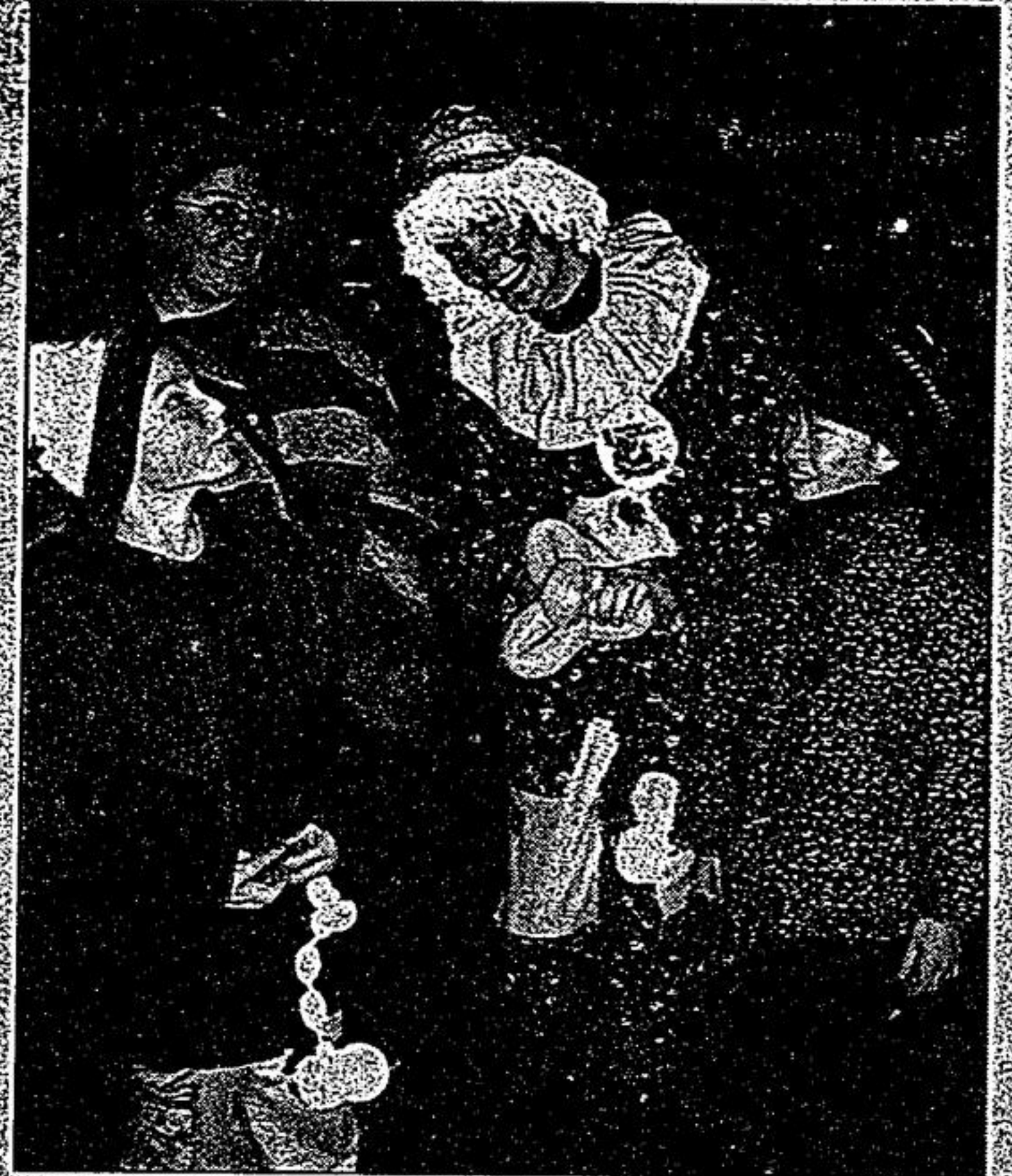
Clowns are just one of many attractions at this year's Markham Village Festival of Lights

As the premiere family event of the year, kids are special at the Markham Festival of Lights. At the Kids Crafts centre, in H&R Block, Main and Robinson, they can make and take some wonderful bead and Christmas creations home. Visit the Petting Zoo at St. Andrew's United Church at the south end of the street and see the Living Creche complete with a live camel. Children can also have a dog cart ride, enjoy the performance by Scrooge, and listen to the Cat'n Fiddle. There are clowns, Madame Buskerly stilt walker and the Travel'n Riverboat Show. St. Andrew's Presbyterian Church is holding a Junior Bazaar with crafts, food and activities. And of course, don't forget to visit Santa who will be located inside on the north-east corner of Main and Robinson Streets. He will be available to hear all those special wishes and