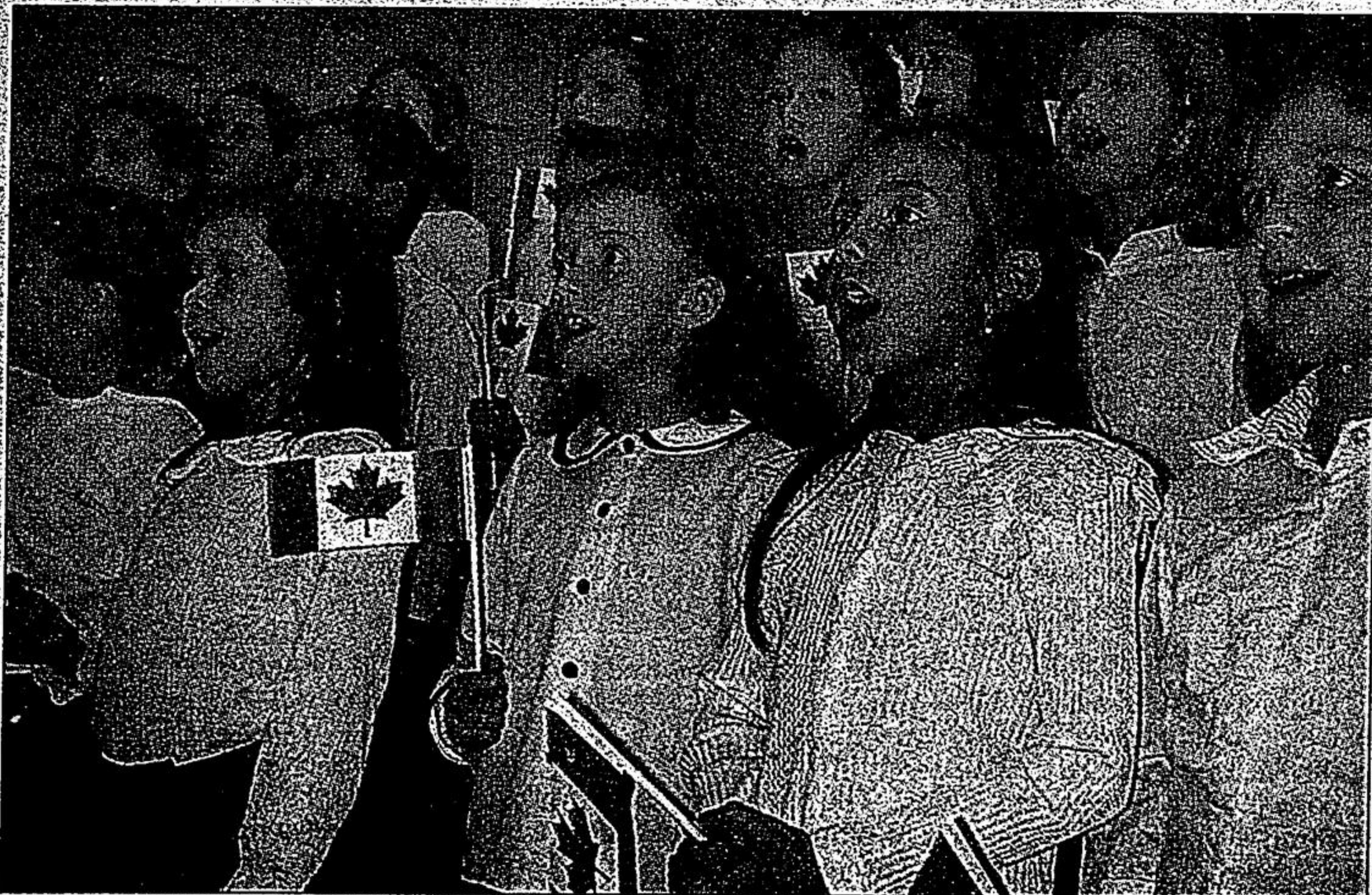
The St-Brigid Catholic School choir opened the concert by leading the audience in O'Canada