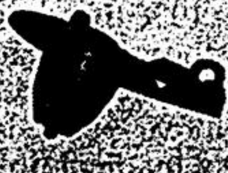
WATER SAVING TOILET FLAPPER