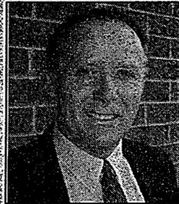
COUNCILLOR WARD SIX