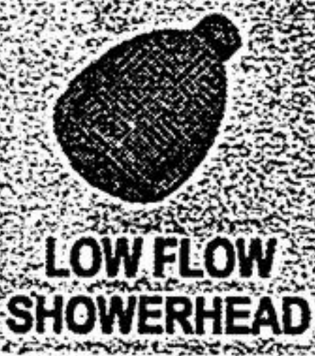
LOW FLOW SHOWERHEAD

CALL NOW To see if you qualify, Local to Richmond Hill 905-771-7192 Other Areas Call 1-800-215-4060