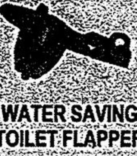
WATER SAVING TOILET FLAPPER

This is part of York Region's effort to ensure a long-term supply of drinking water, for today and tomorrow