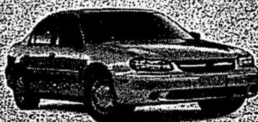
2003 CHEVROLET MALIBU

$5,350 OFF PLUS $500 BONUS* CASH PURCHASE PRICE