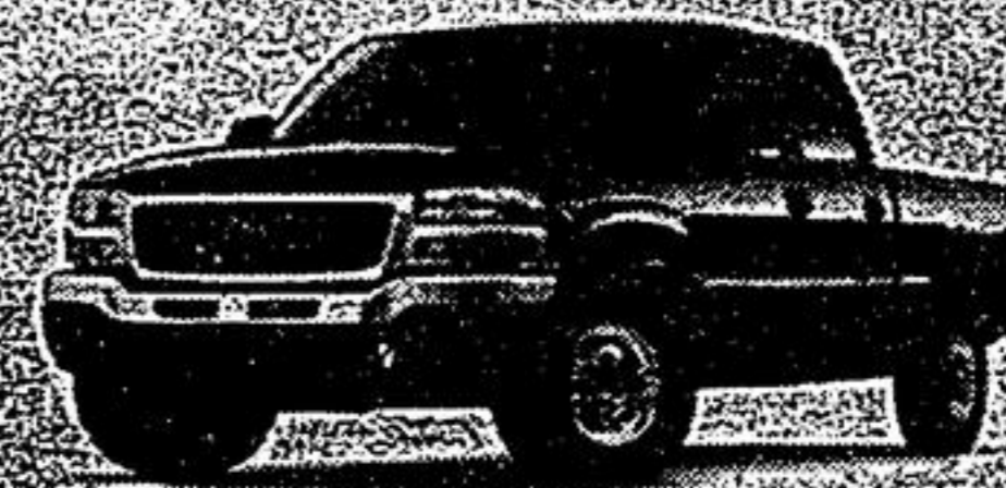
GMC 2003 SIERRA

$2,000 OFF PLUS $500 BONUS* CASH PURCHASE PRICE