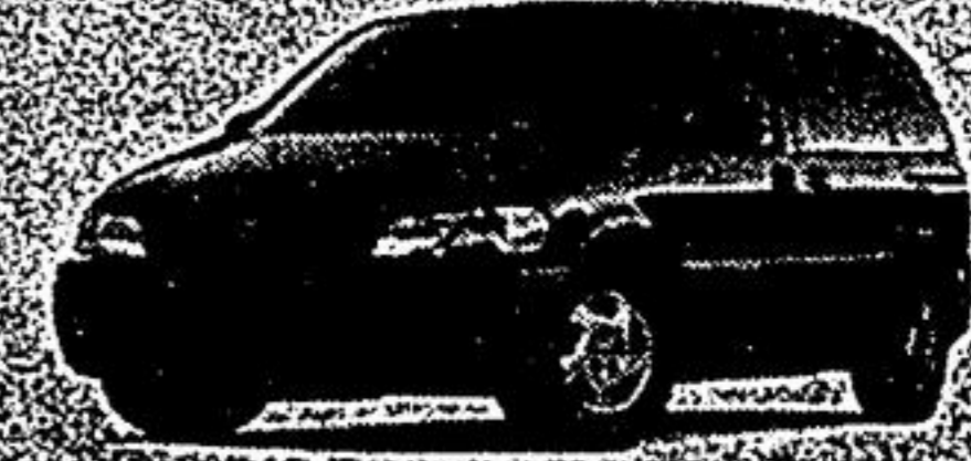
2003 PONTIAC MONTANA

$6,500 OFF PLUS $500 BONUS* CASH PURCHASE PRICE