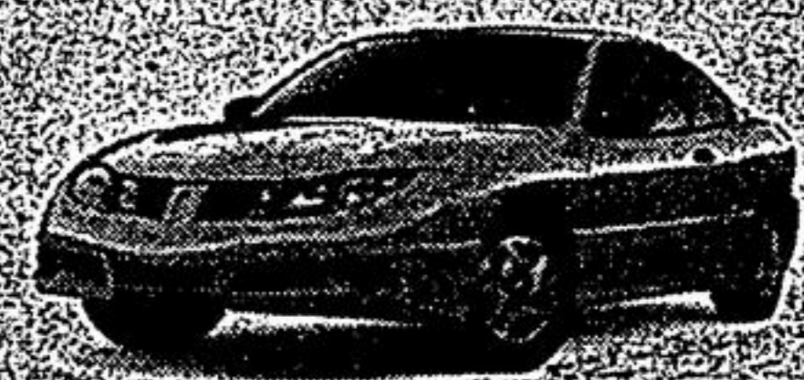
2003 PONTIAC SUNFIRE

$4,500 OFF PLUS $500 BONUS* CASH PURCHASE PRICE