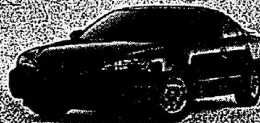
2003 PONTIAC GRAND AM

$4,600 OFF PLUS $500 BONUS* CASH PURCHASE PRICE