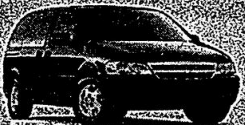
2003 CHEVROLET VENTURE

$6,500 OFF PLUS $500 BONUS* CASH PURCHASE PRICE