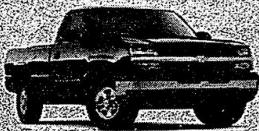
2003 CHEVY SILVERADO

$2,000 OFF PLUS $500 BONUS* CASH PURCHASE PRICE