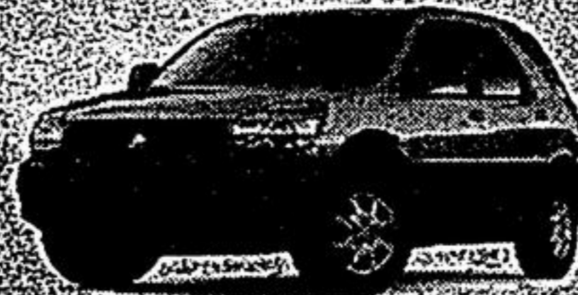
2003 BUICK RENDEZVOUS

$3,000 OFF PLUS $500 BONUS* CASH PURCHASE PRICE