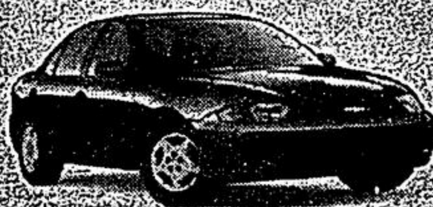
2003 CHEVROLET CAVALIER

$4,500 OFF PLUS $500 BONUS* CASH PURCHASE PRICE