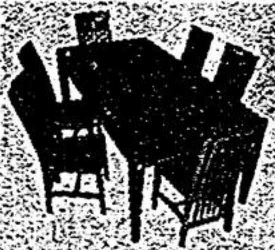
Solid Teak Dining Table w/6 Chairs $1,913 $2,399