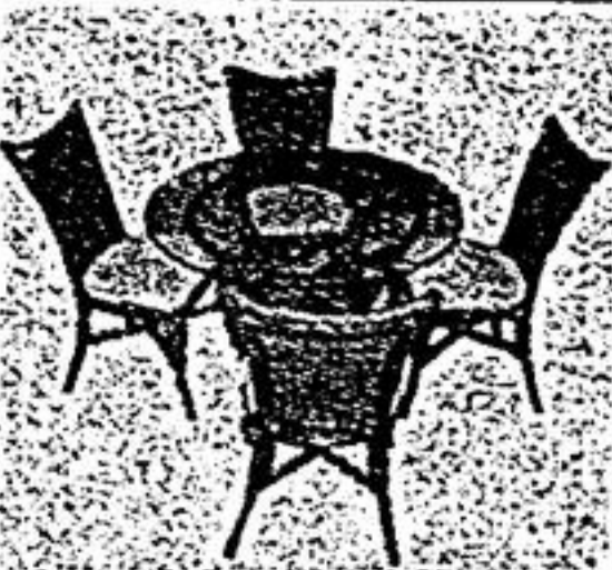
Rattan Dinette Set w/4 Chairs $699 $999

9255 Woodbine Ave. (in the Cachet Centre) (905) 887-9322