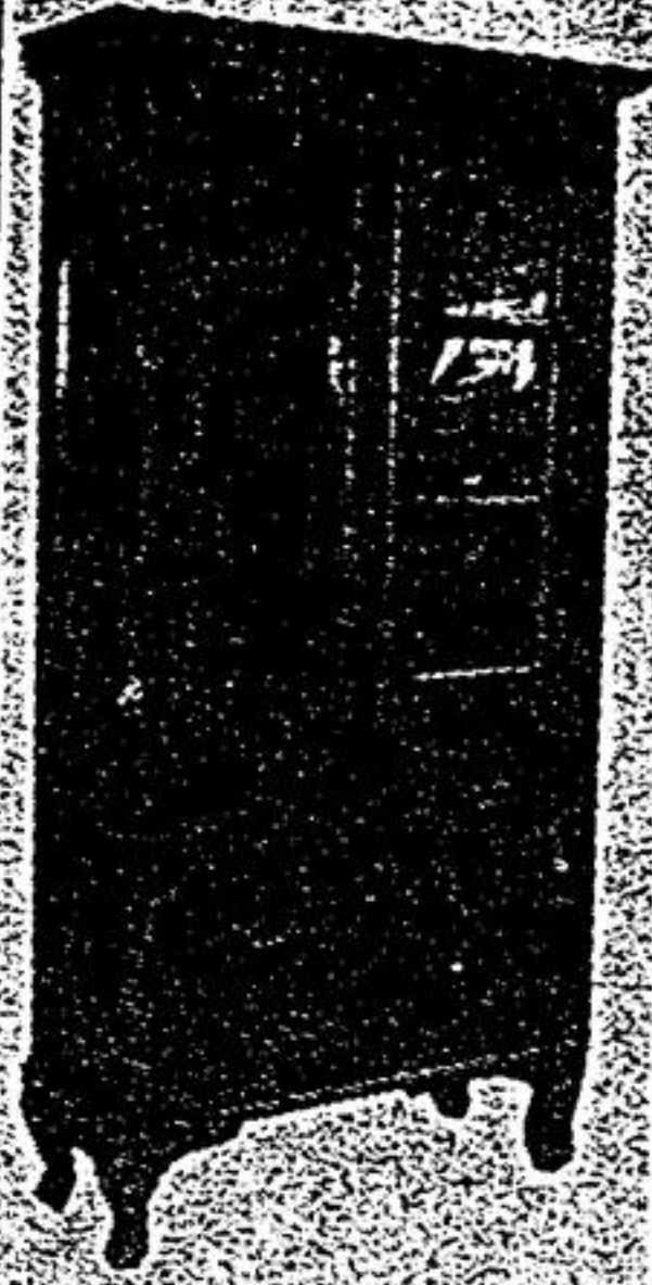
Solid Mahogany Cabinet $599 $749

Come see our beautiful collection of Indonesian style furniture. Handcrafted from solid teak, mahogany and rattan.