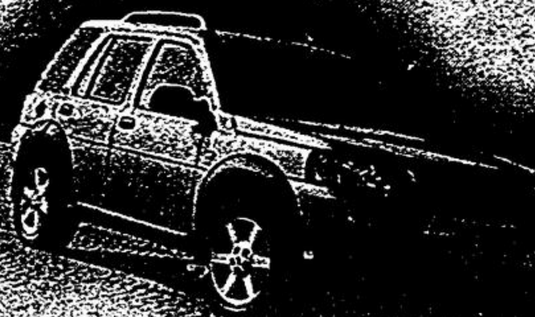
IMPROVED FREELANDER [ PAGE 13 ]