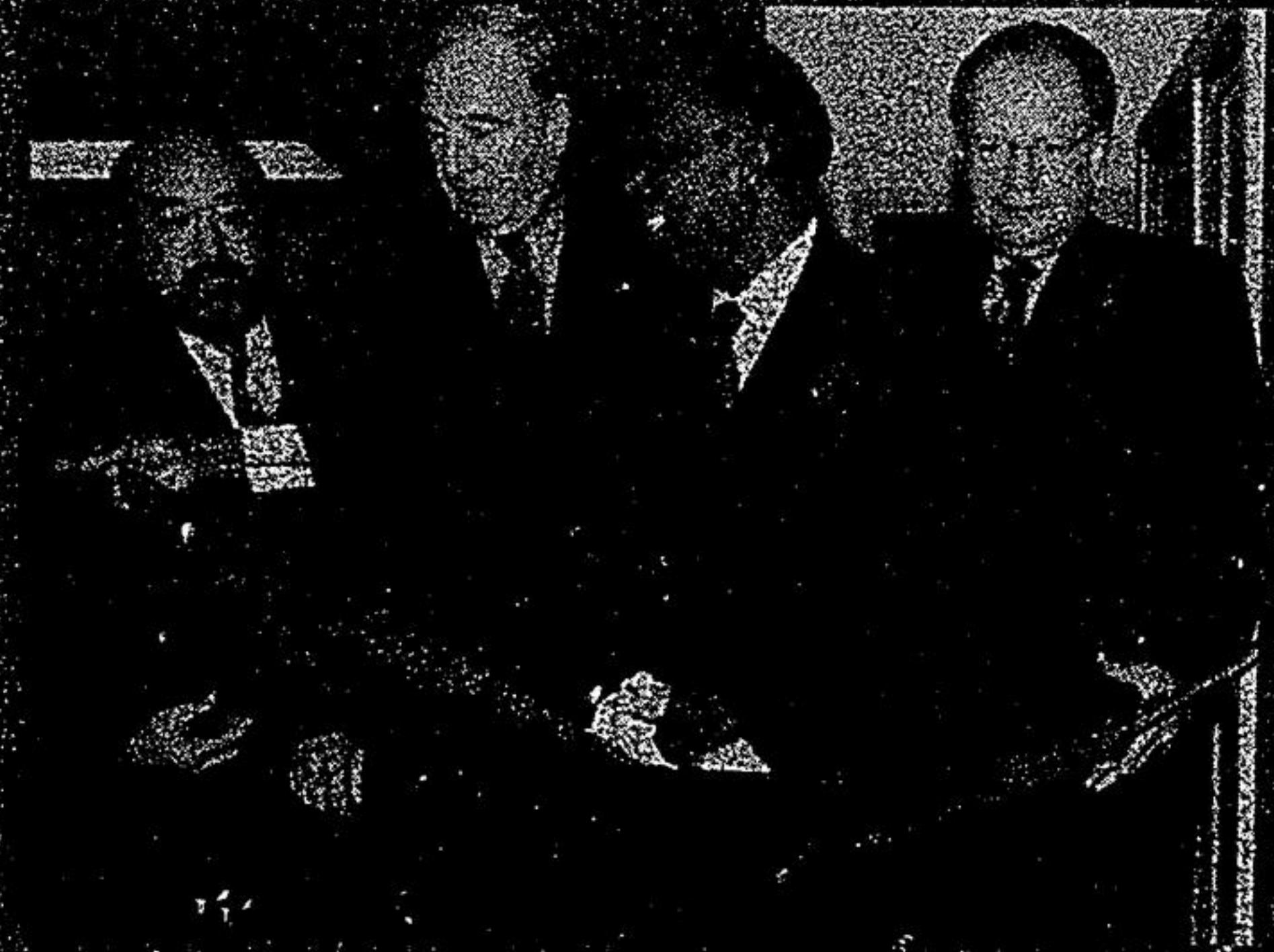
Inaugural Ceremony of Innopharm, Markham, 1999