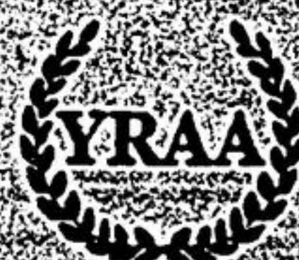
YORK REGION ATHLETIC ASSOCIATION

Please leave names of participating team members, graduation year, phone number and e-mail address.