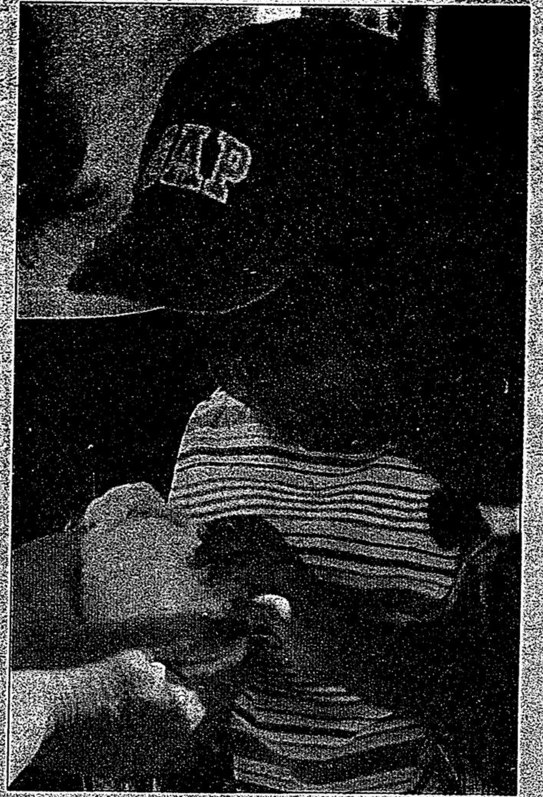
Deandre Trotman, 3, meets a bunny at the market.