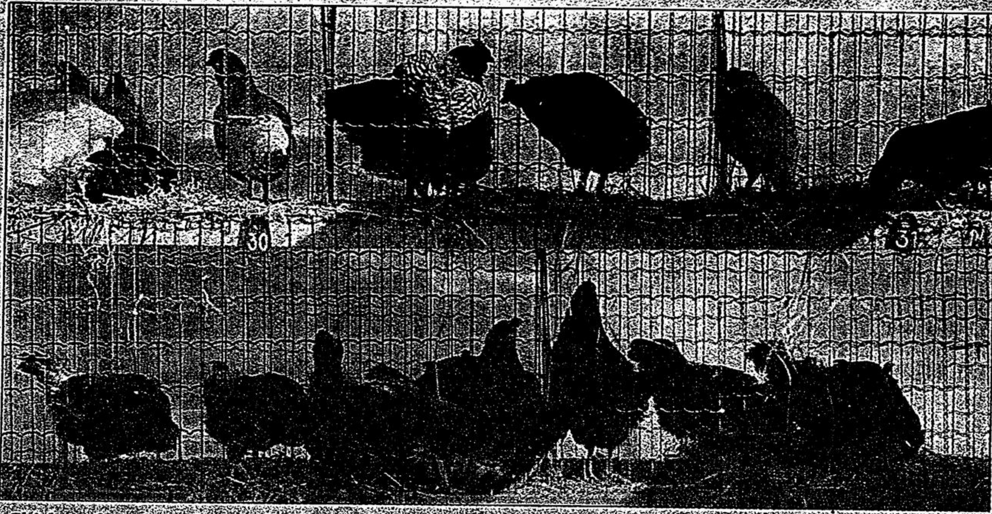
Chickens for sale at the Stouffville Country Market Saturday. The market is a popular tourist destination.