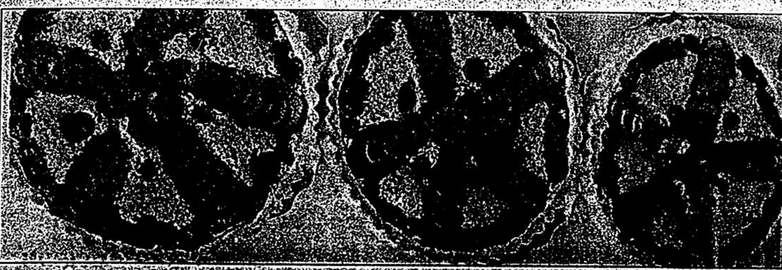
Colourful strawberry and blueberry flans by CC's Catering on display.