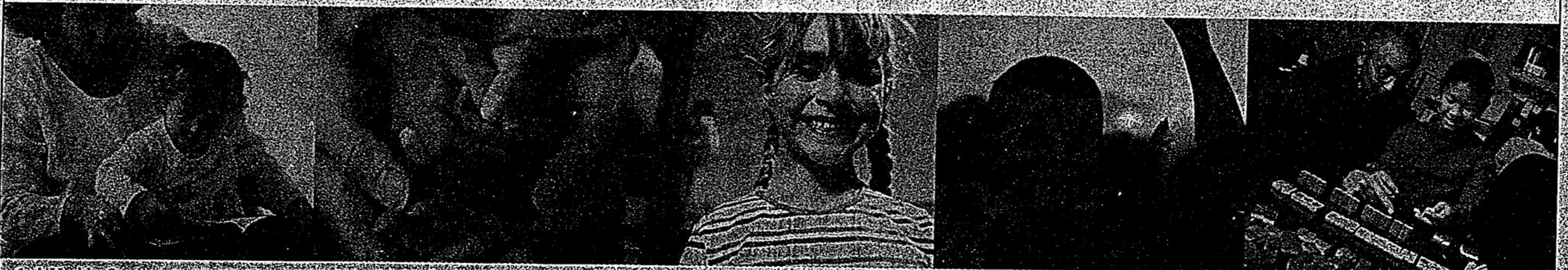
1. A Healthy Start