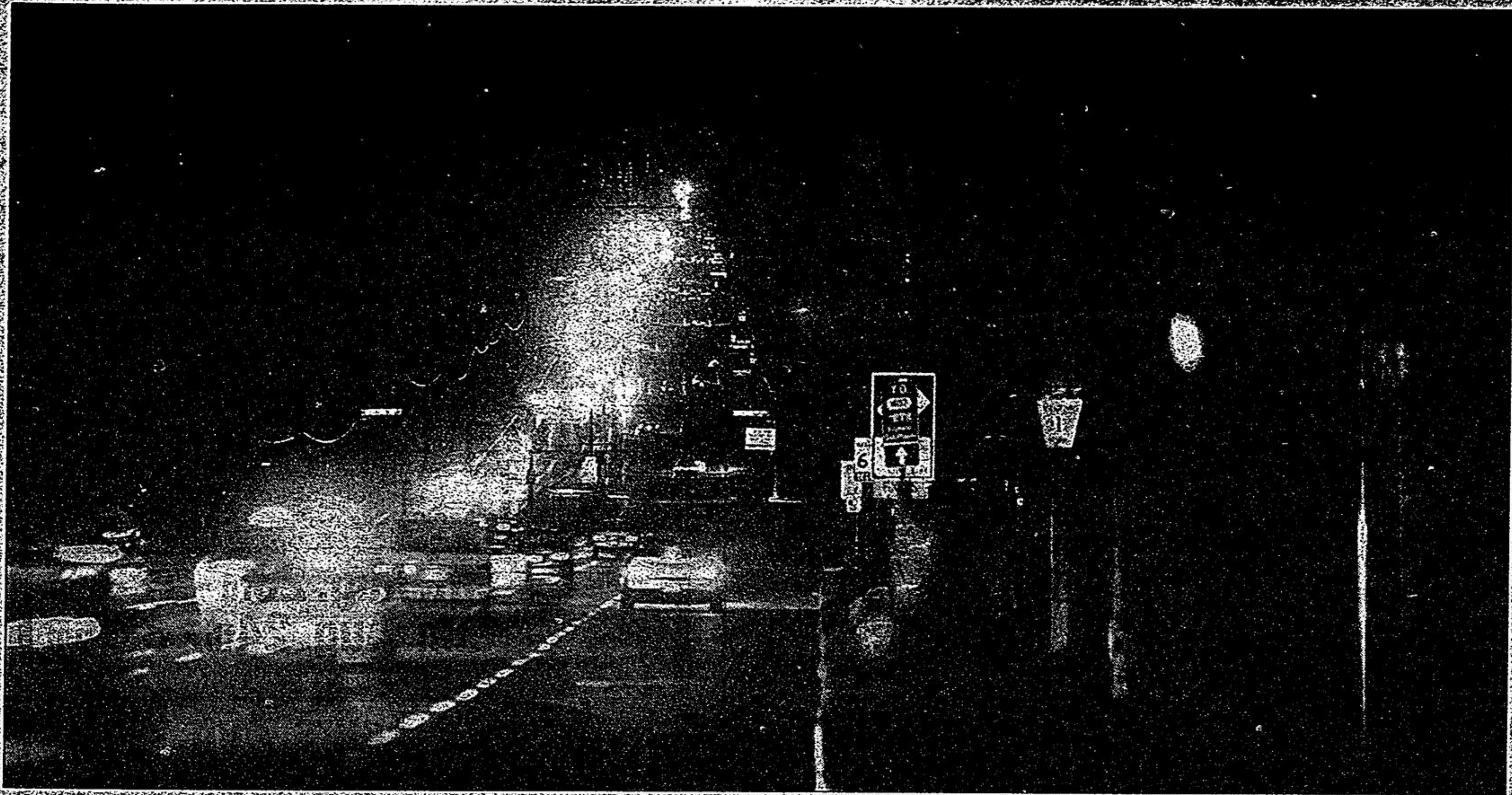
Looking south on Yonge Street at Major Mackenzie Drive as it is seldom seen at 9:30 p.m. with lights out in all buildings.