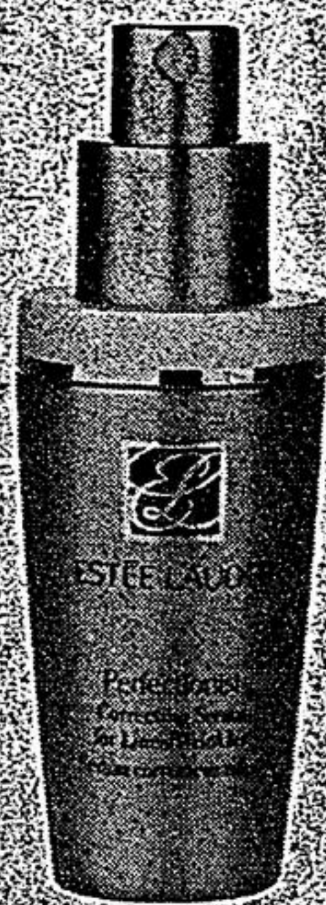
Perfectionist Retinol-free correcting serum that reduces the look of fine dry lines. 30 mL $70